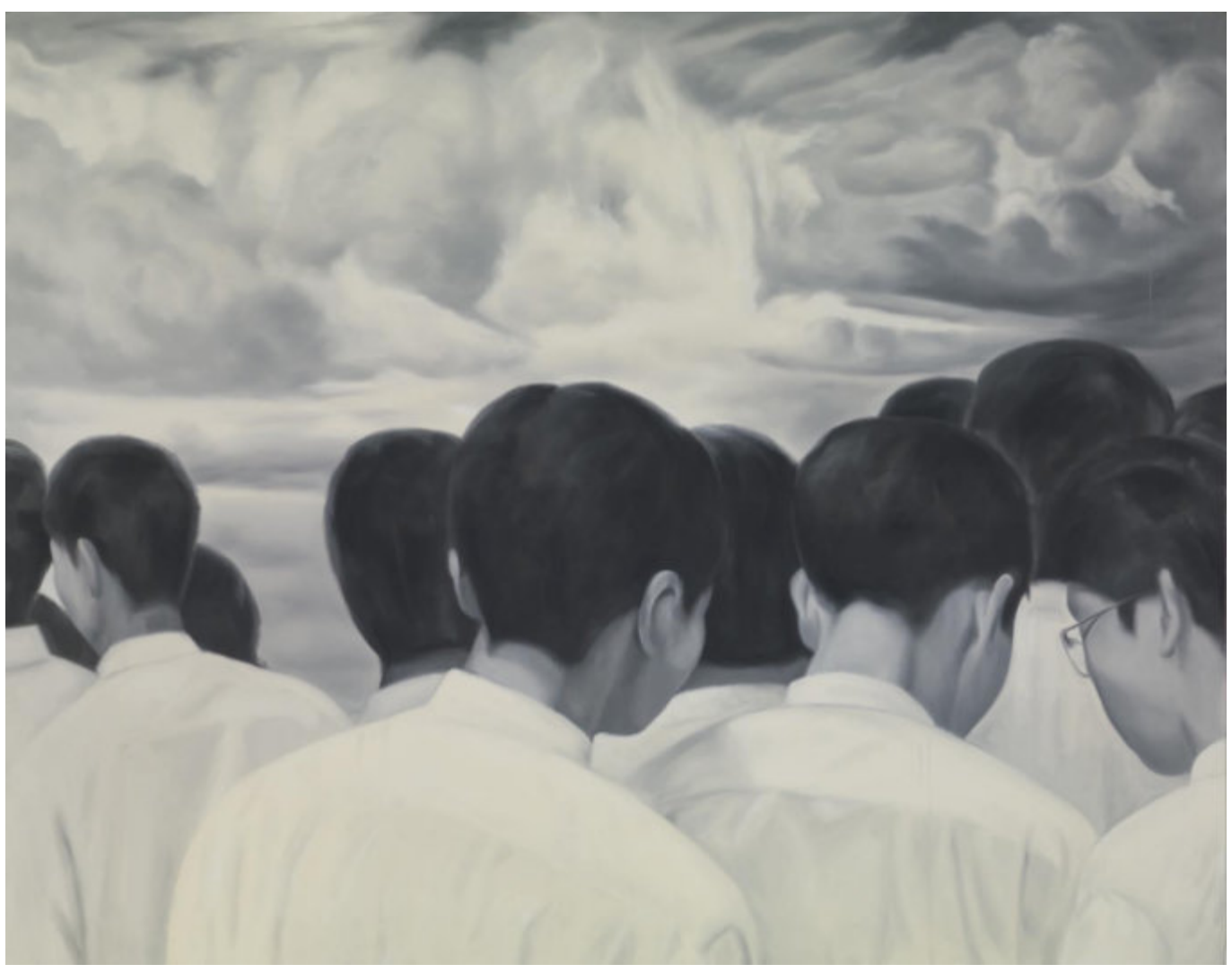
AFTER FU HONG. 2009