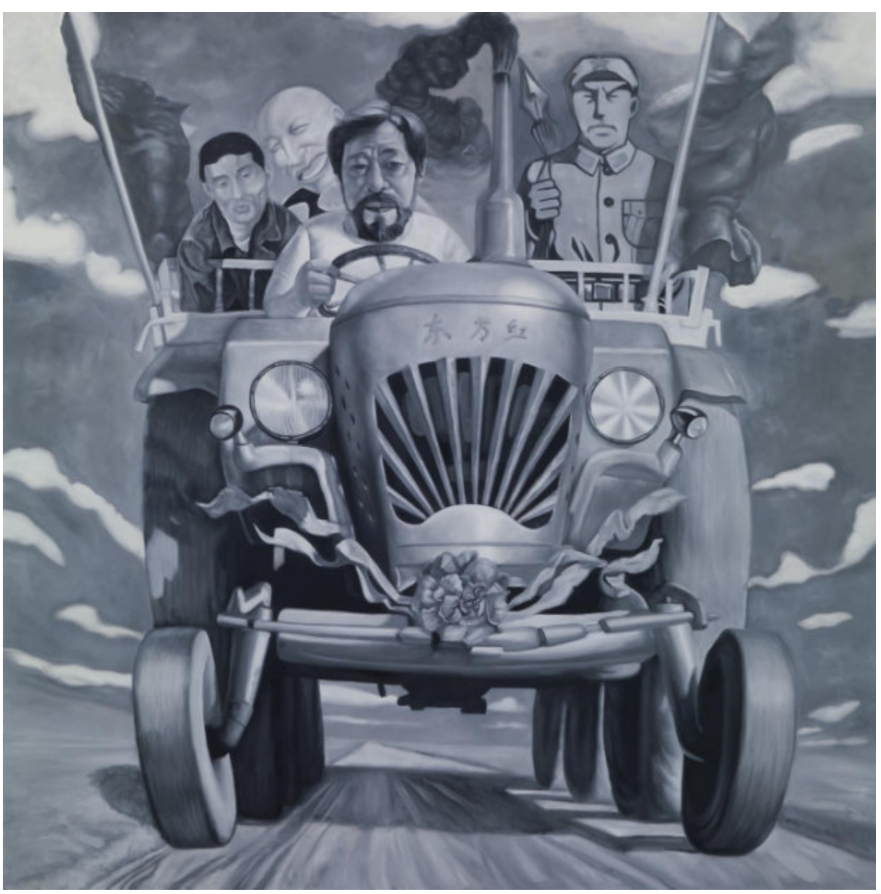
AFTER WANG XINGWEI. 2009