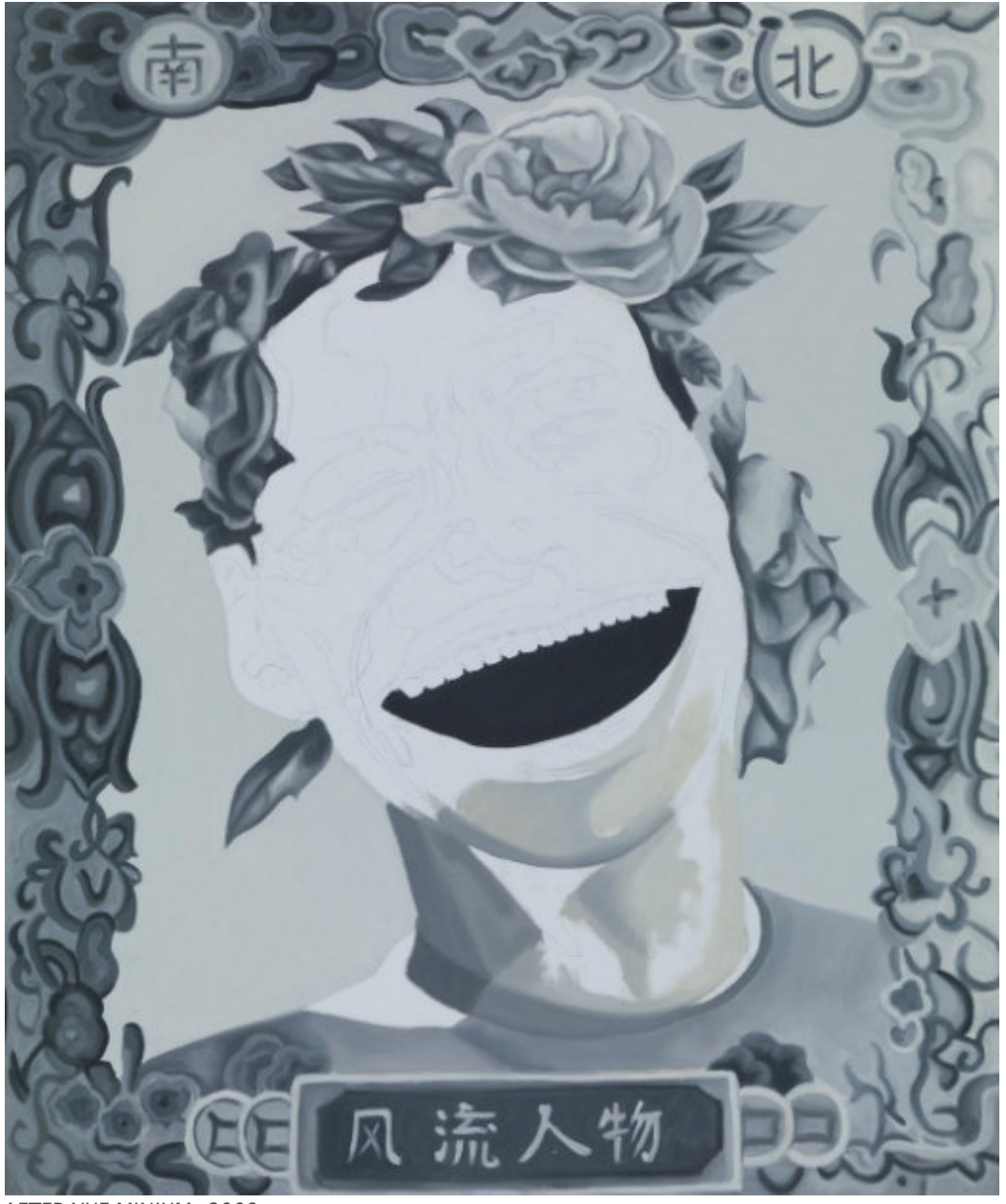
AFTER YUE MINJUM. 2009