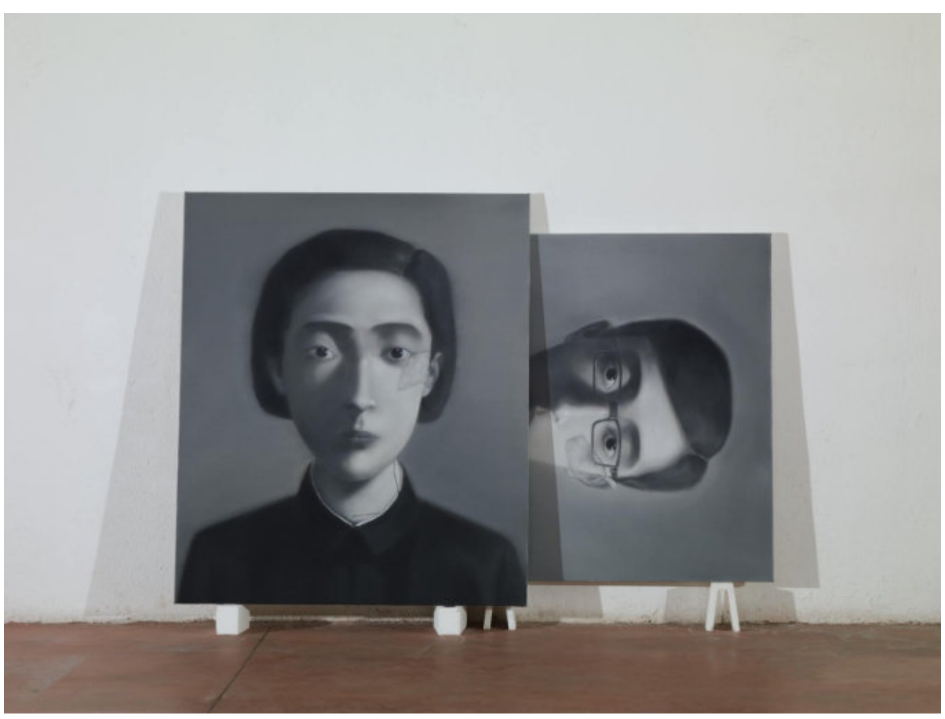
INSTALLATION VIEW / COMPOSITION, 2009.