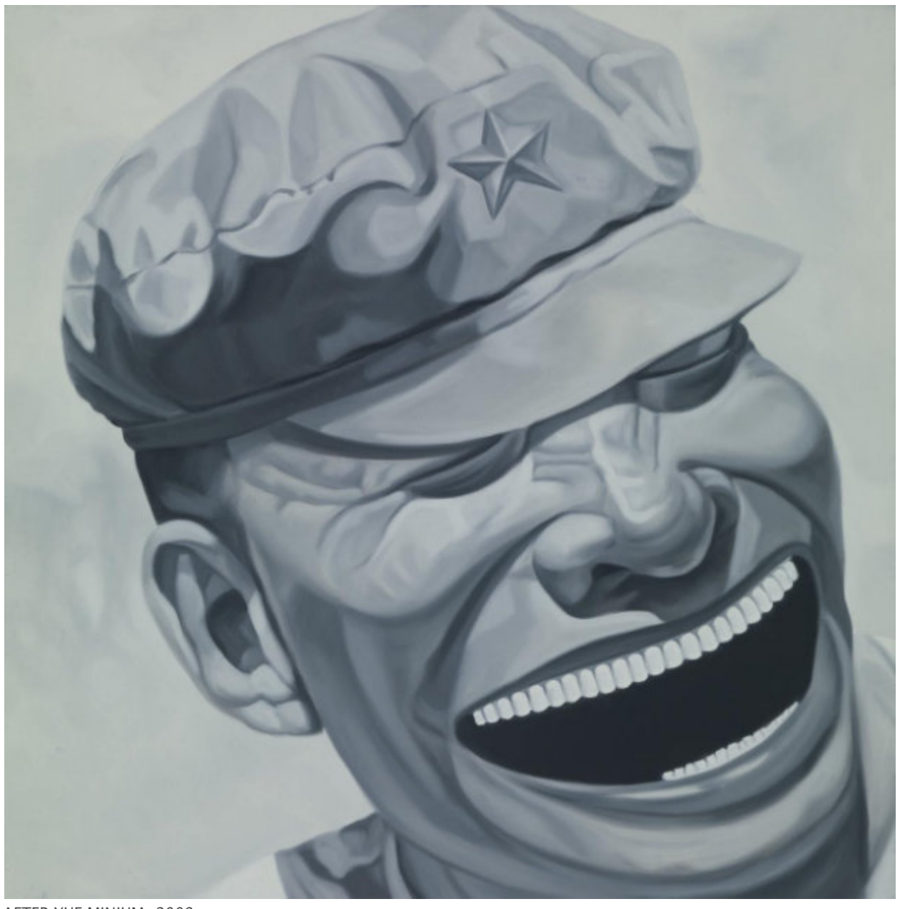
AFTER YUE MINJUM. 2009