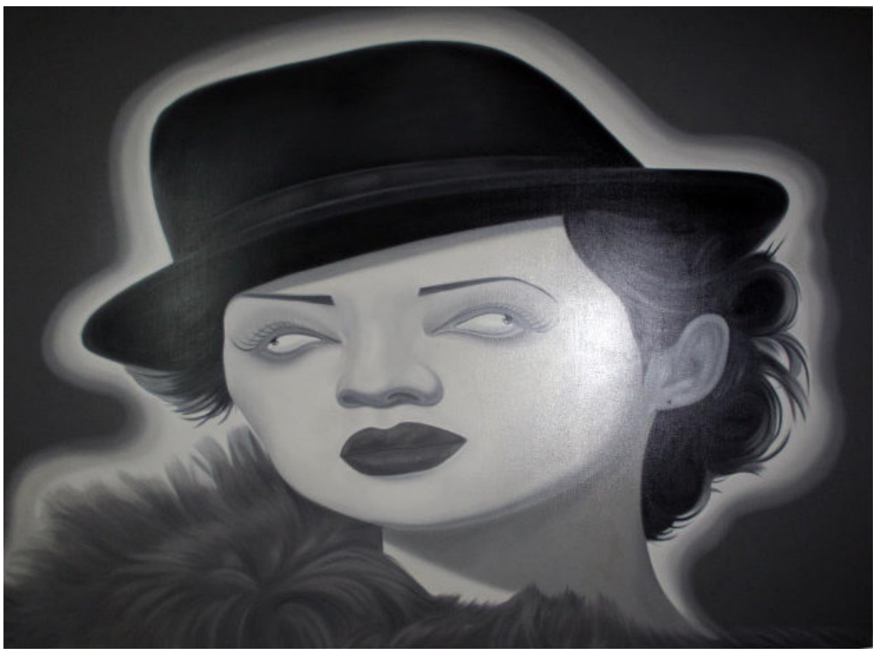
AFTER FENG ZHENGJIE. 2009