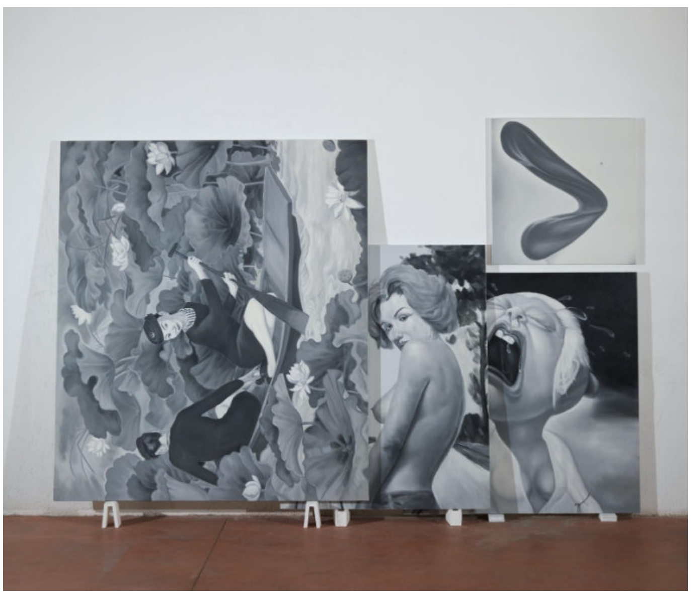
INSTALLATION VIEW / COMPOSITION, 2009.