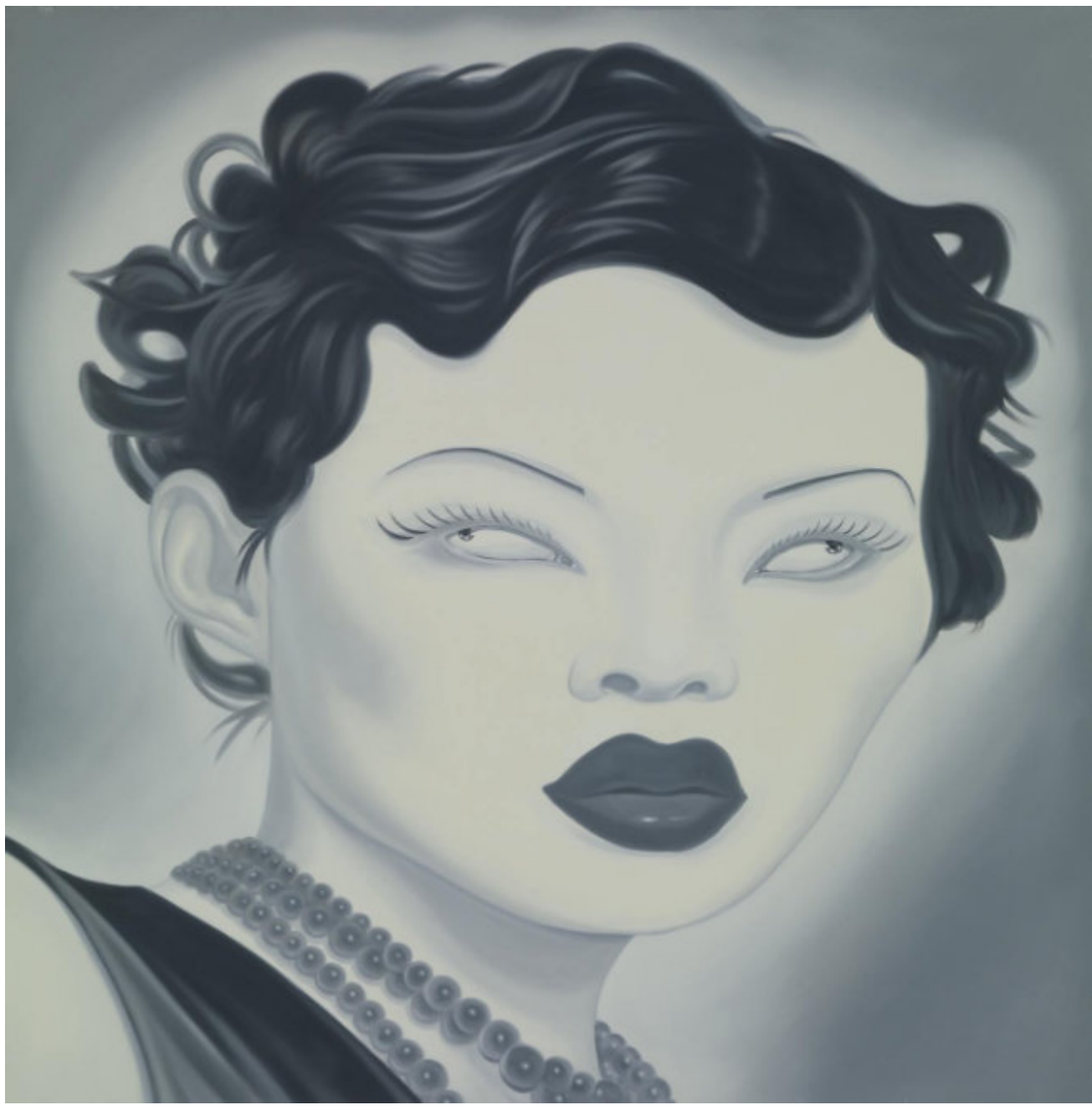
AFTER FENG ZHENGJIE. 2009