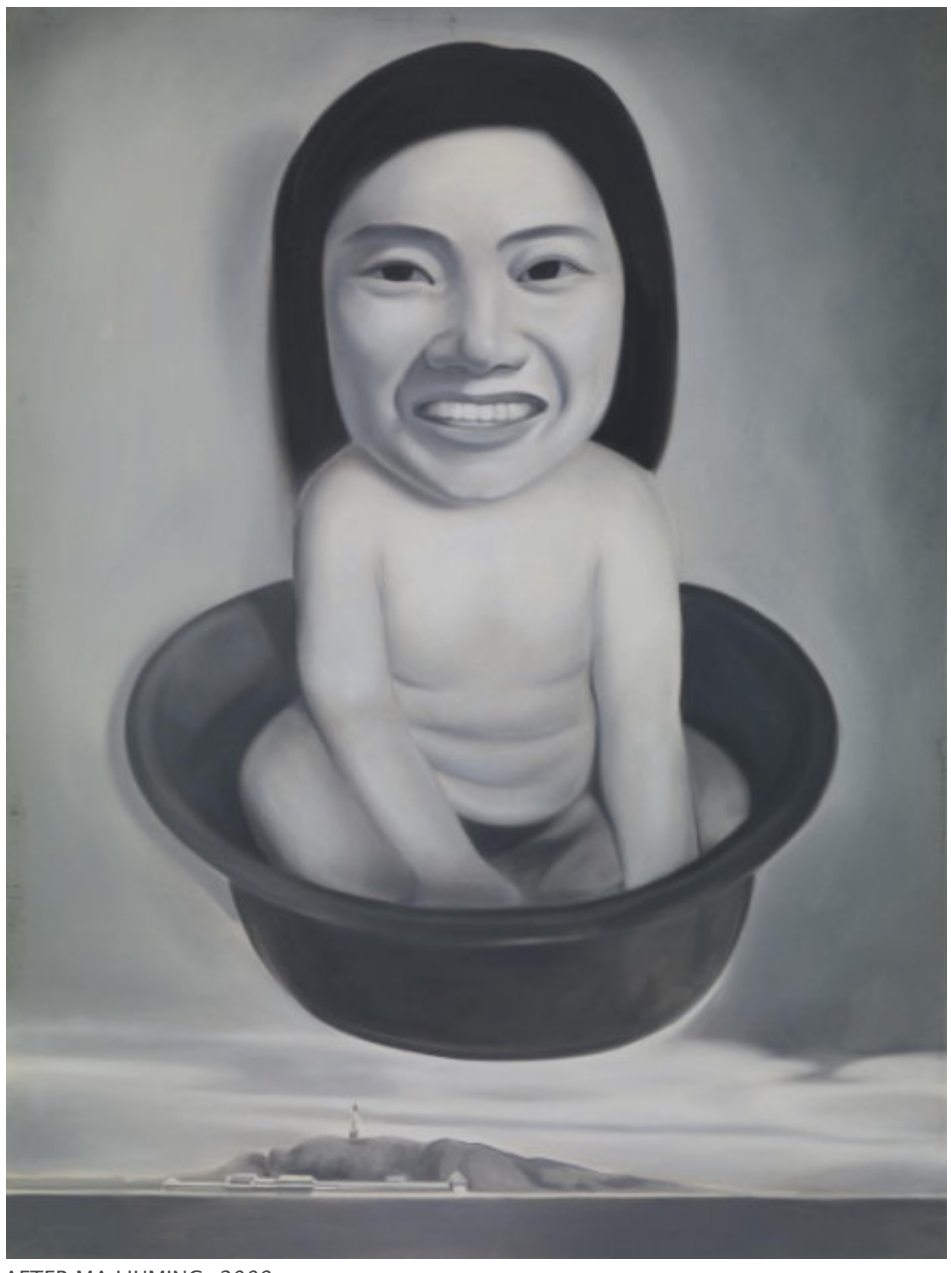
AFTER MA LIUMING. 2009