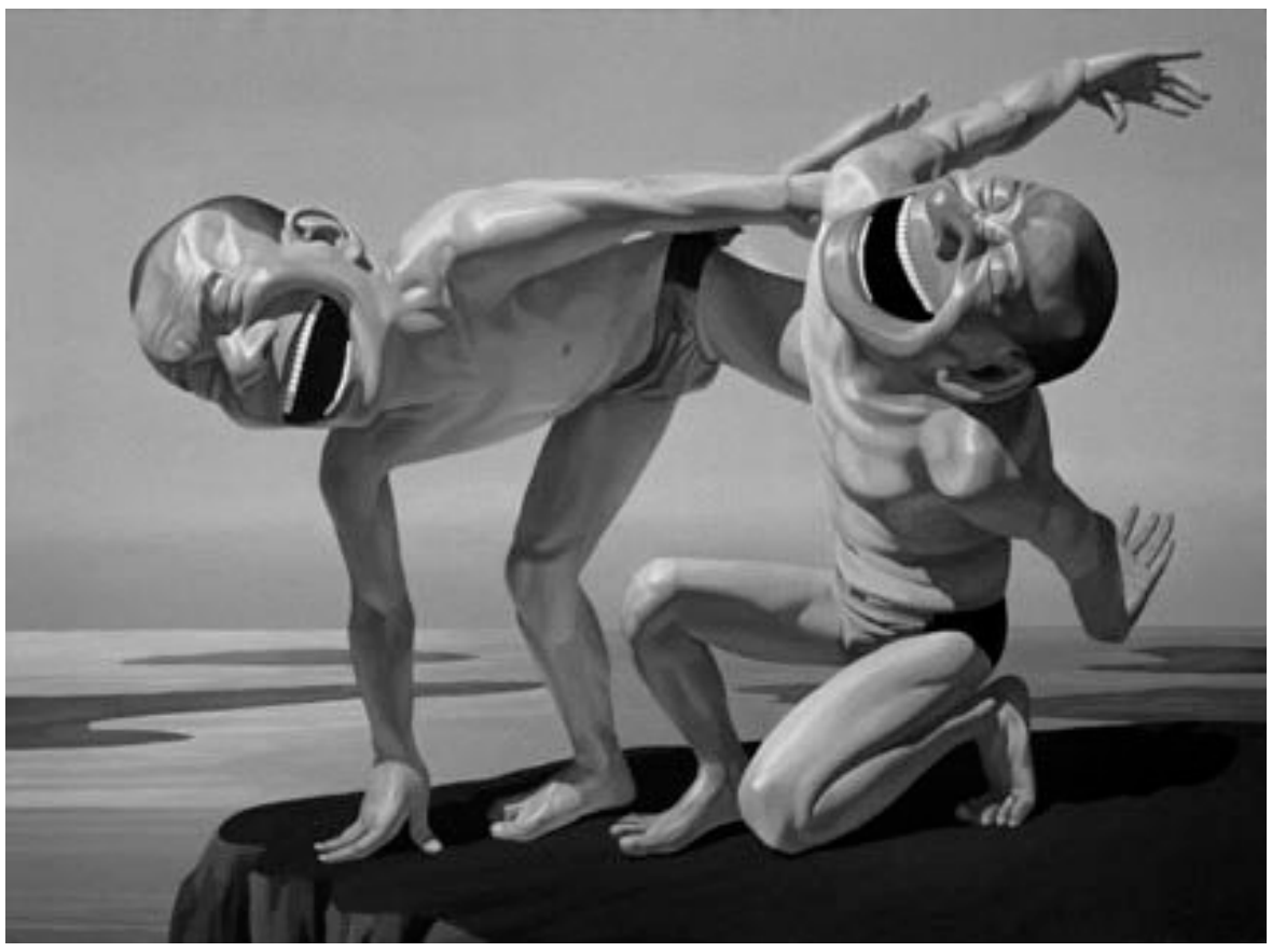
AFTER YUE MINJUM. 2009