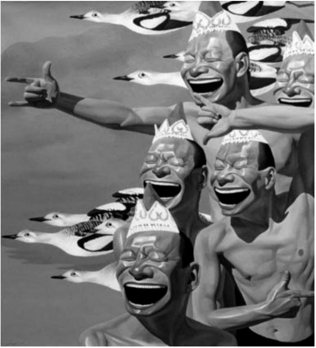
AFTER YUE MINJUM. 2009