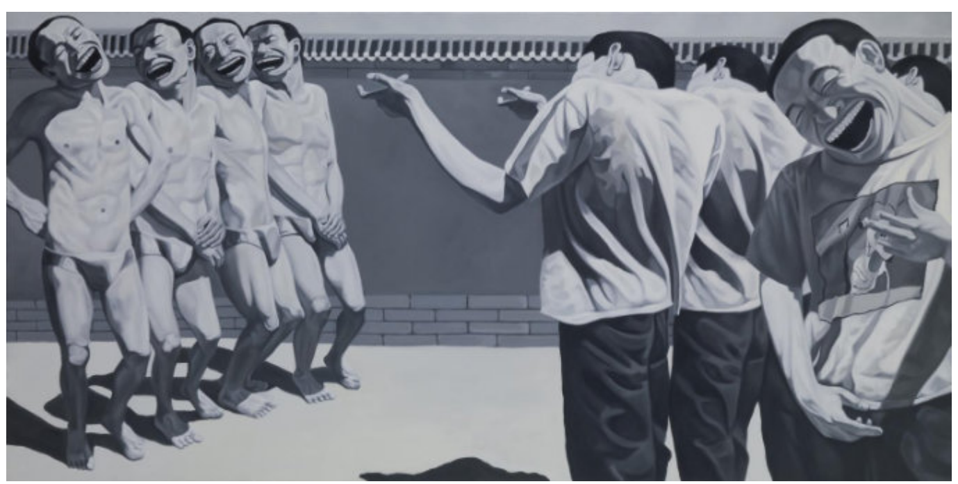
AFTER YUE MINJUM. 2009