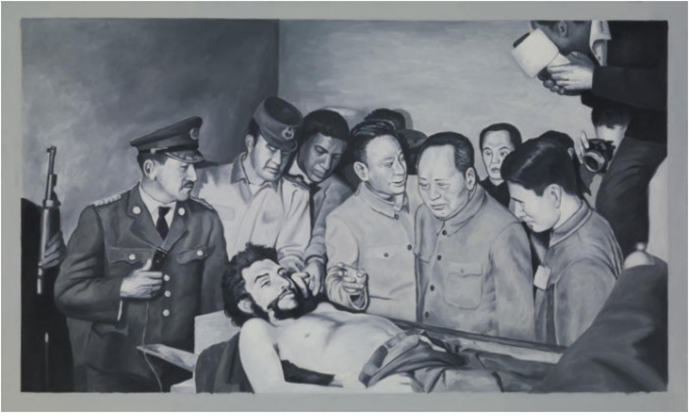
AFTER SHI XINNING. 2009