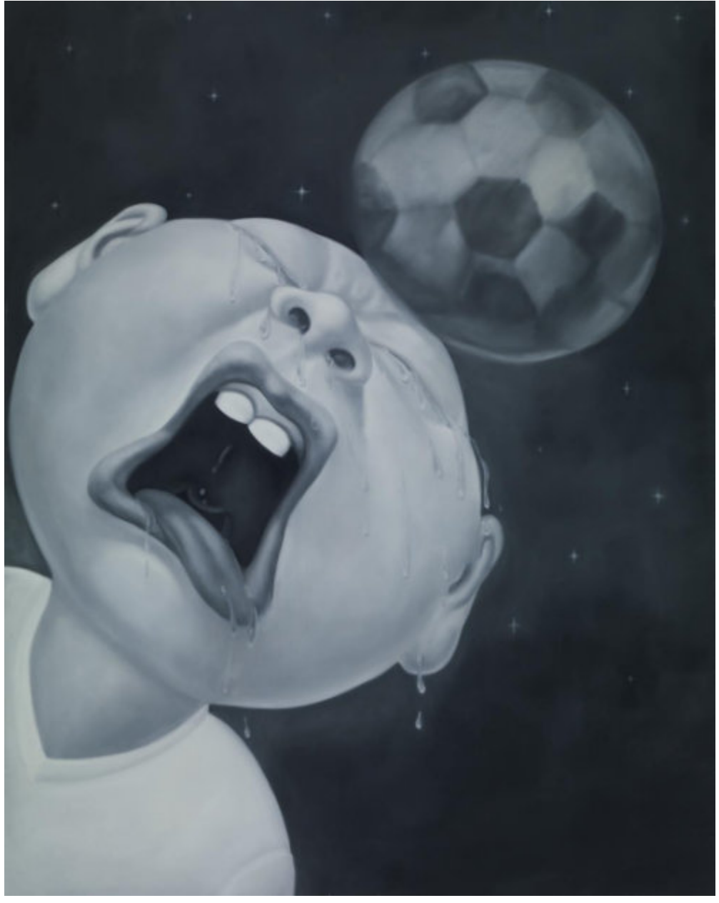
AFTER YIN JUN. 2009