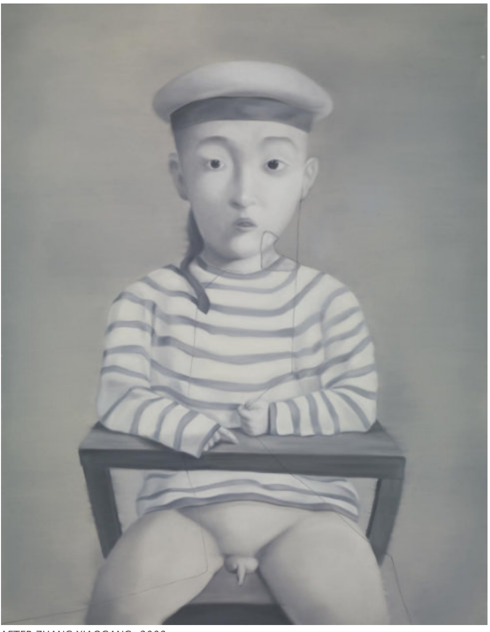
AFTER ZHANG XIAOGANG. 2009