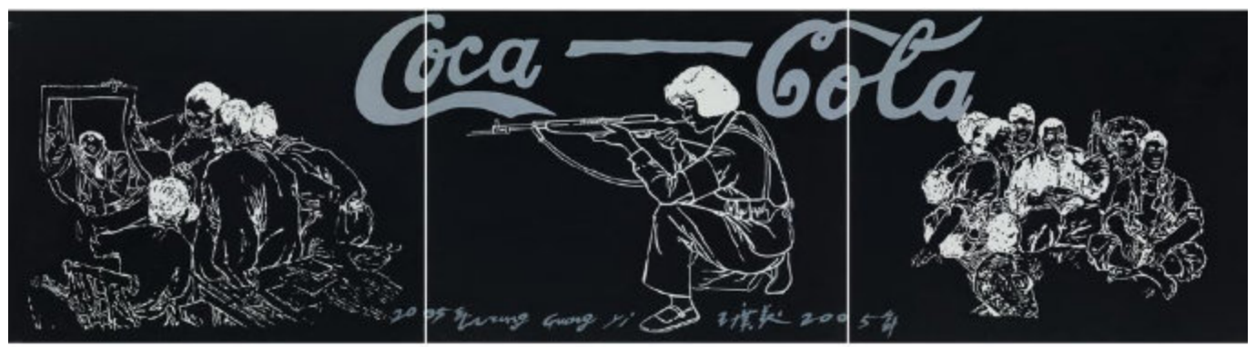
AFTER WANG GUANGYI. 2009 (TRIPTYCH)