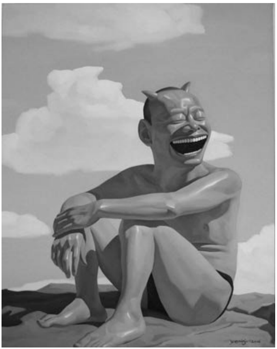
AFTER YUE MINJUM. 2009