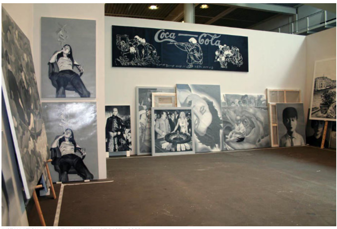
INSTALLATION VIEW ART UNLIMITED/ART BASEL, 2009.