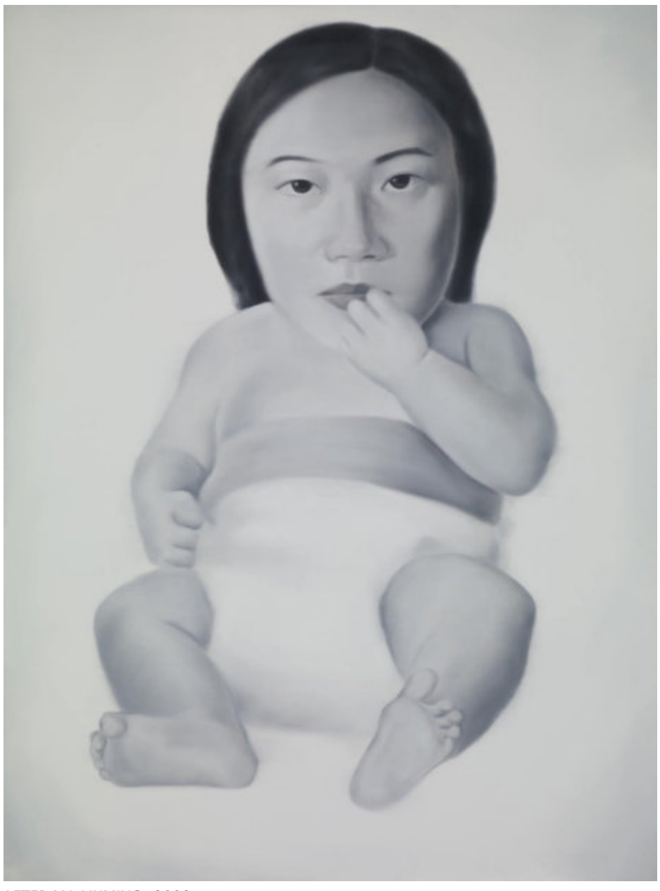
AFTER MA LIUMING. 2009