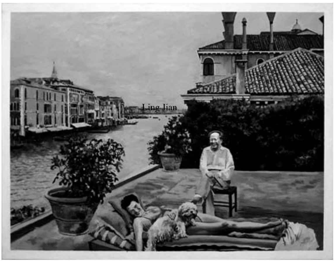
AFTER SHI XINNING. 2009