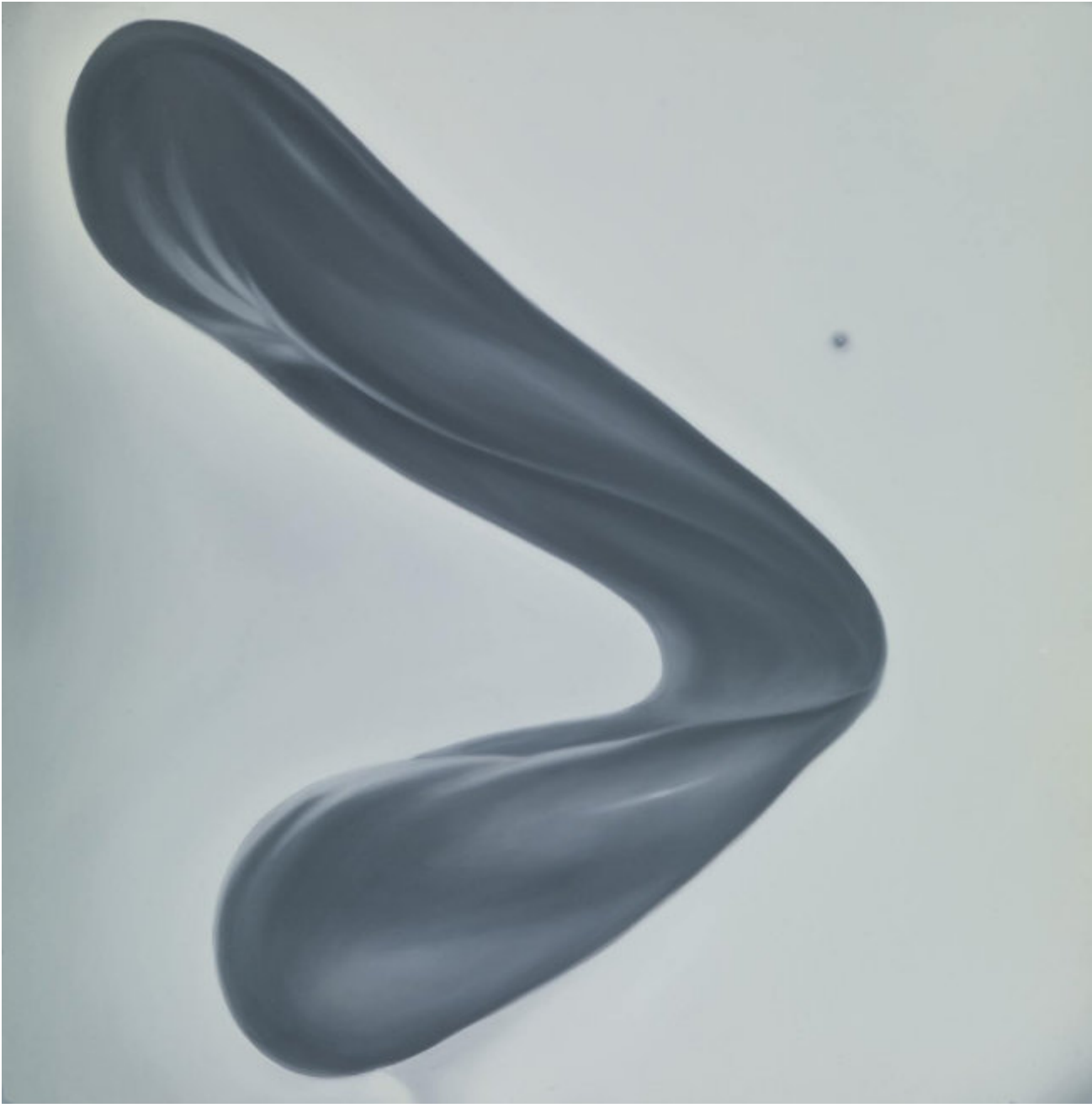
AFTER FENG ZHENGJIE. 2009