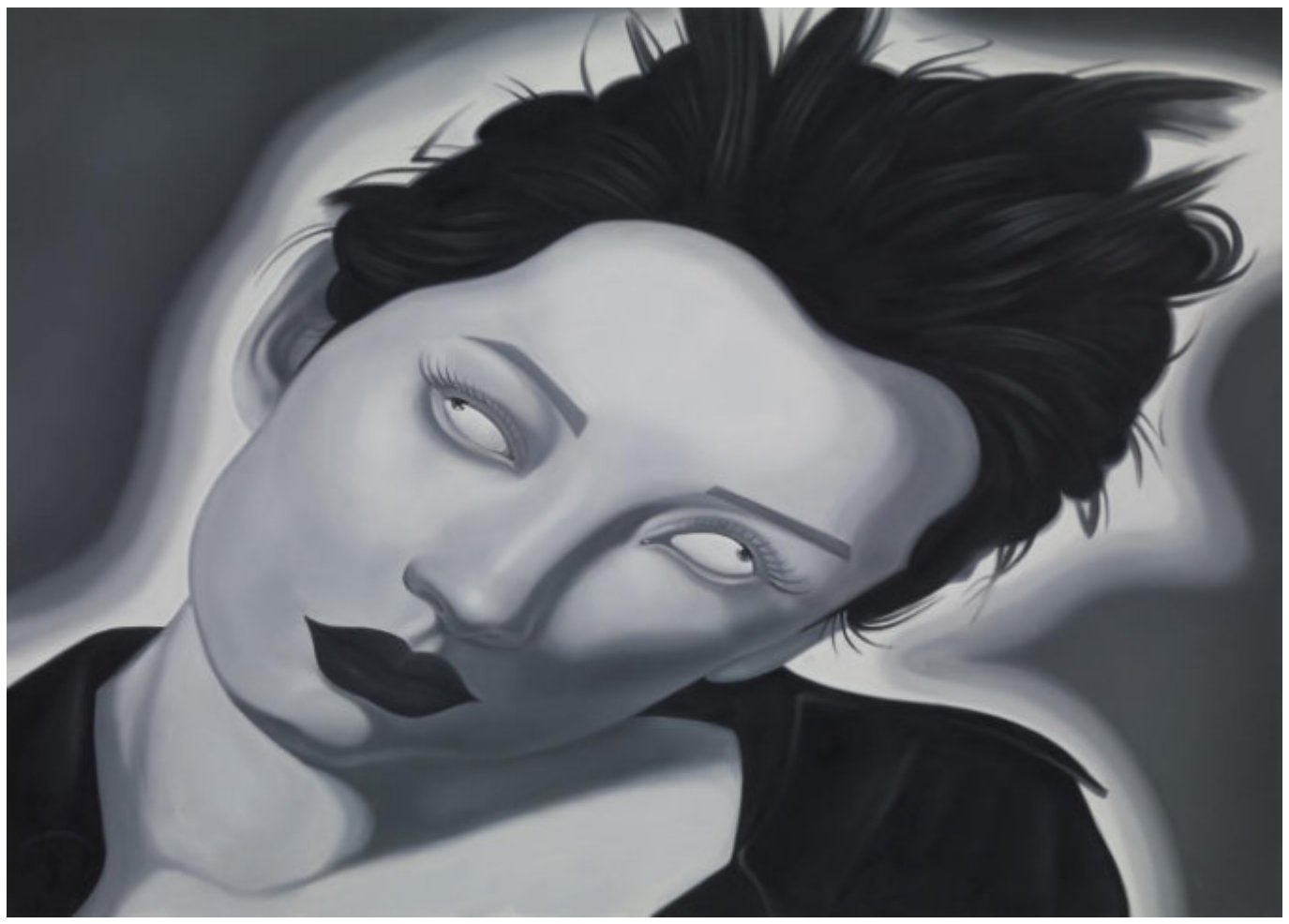
AFTER FENG ZHENGJIE. 2009