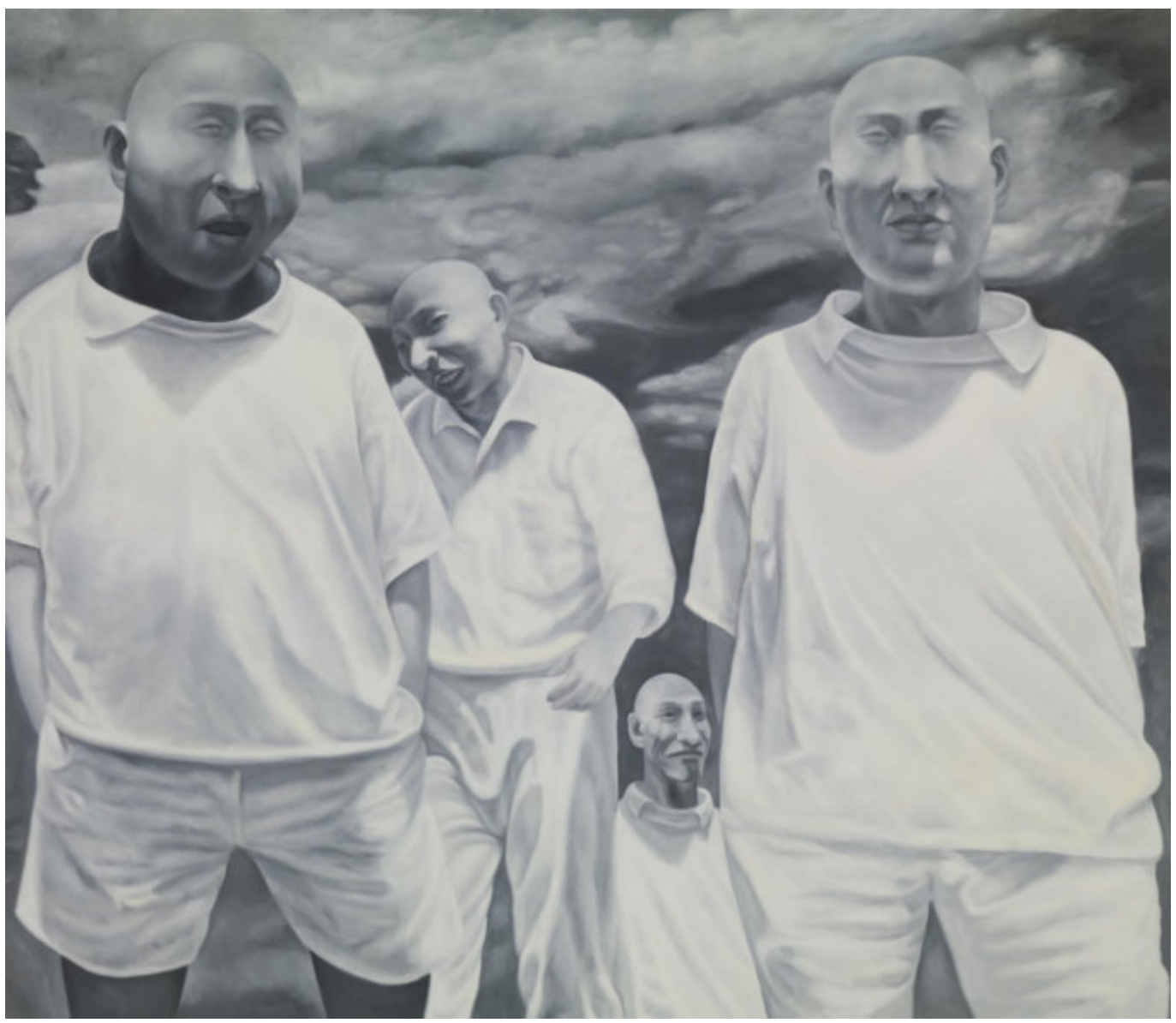
AFTER FANG LIJN. 2009