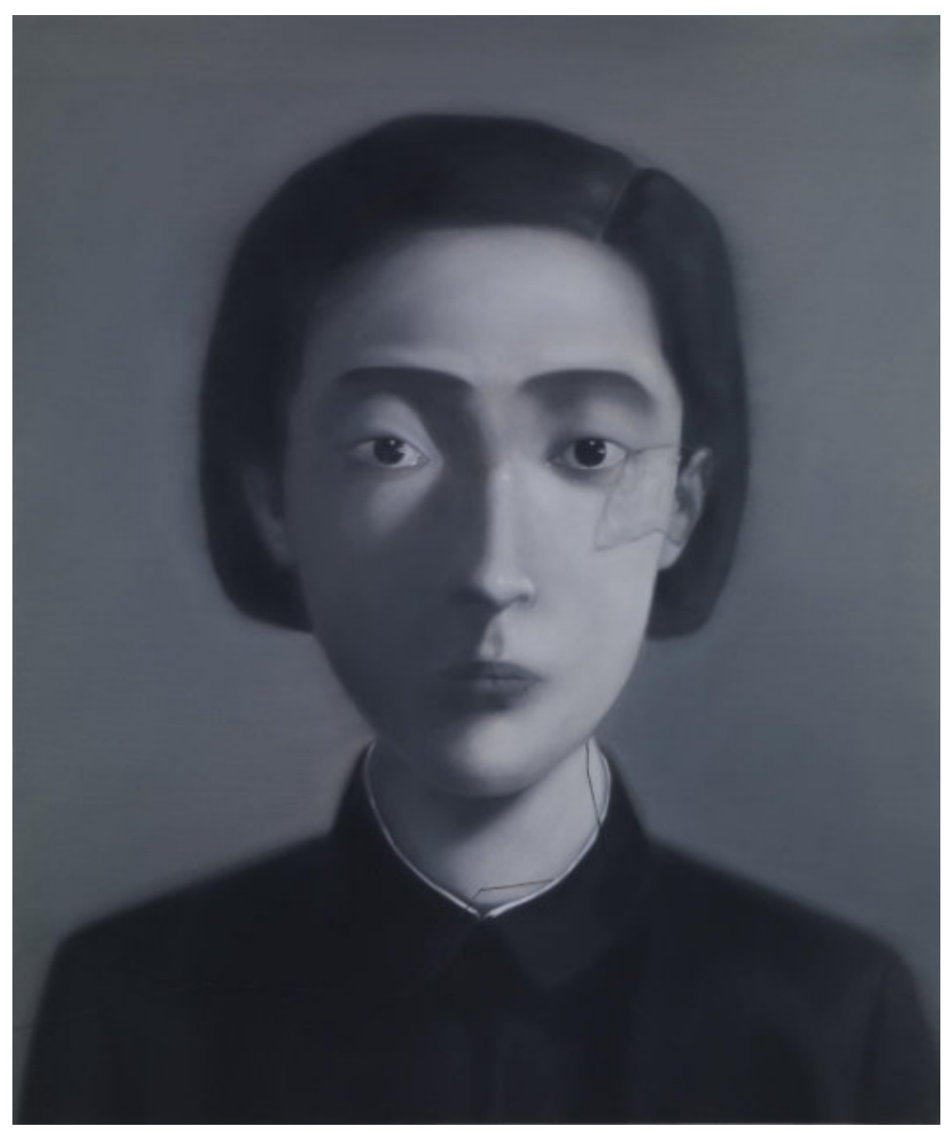
AFTER ZHANG XIAOGANG. 2009