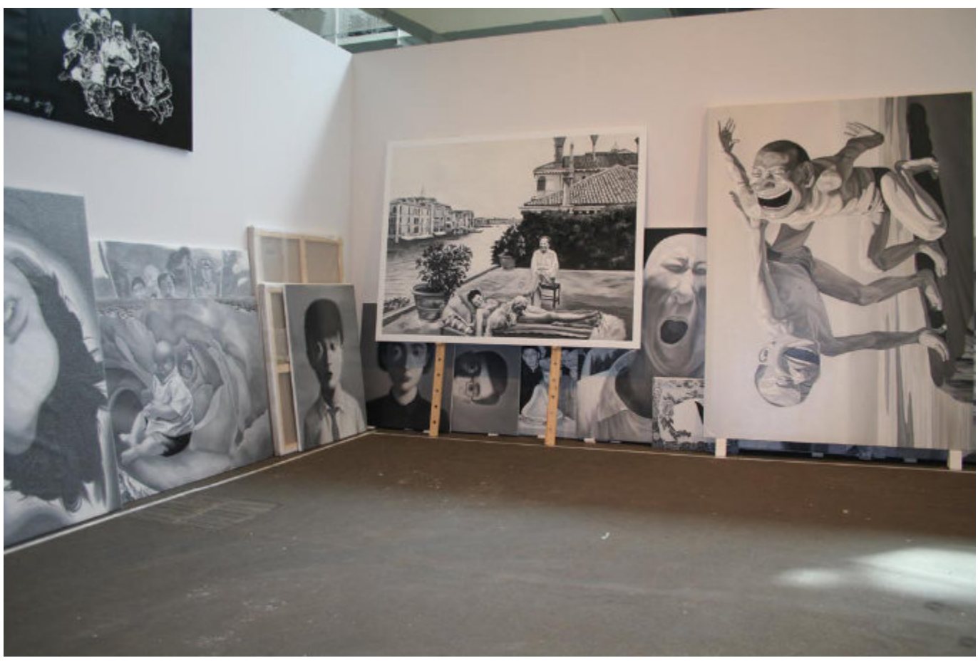
INSTALLATION VIEW ART UNLIMITED/ART BASEL, 2009.