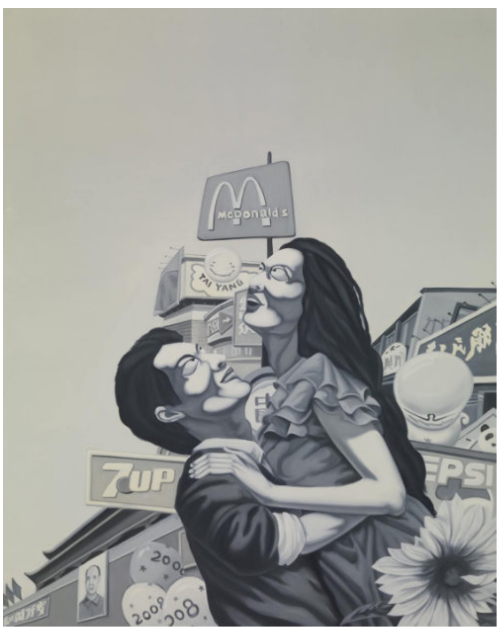
AFTER ZHAO BO. 2009