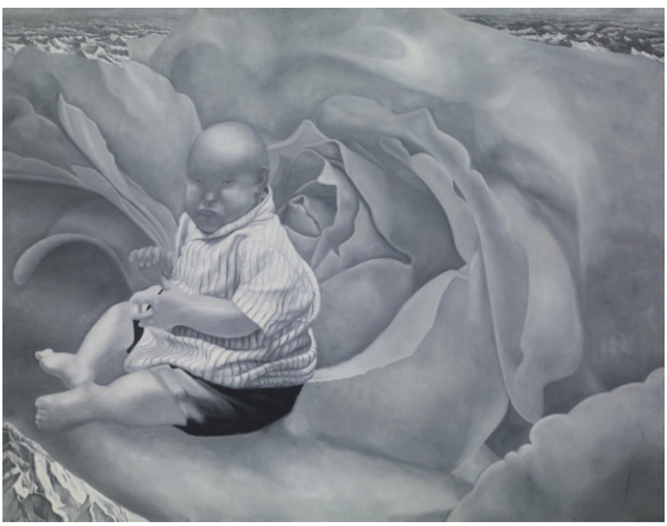
AFTER FANG LIJN. 2009