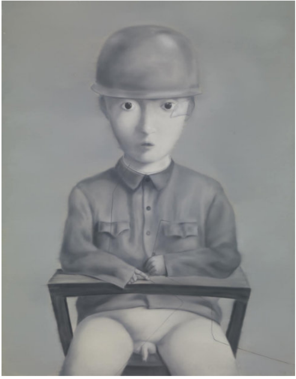
AFTER ZHANG XIAOGANG. 2009