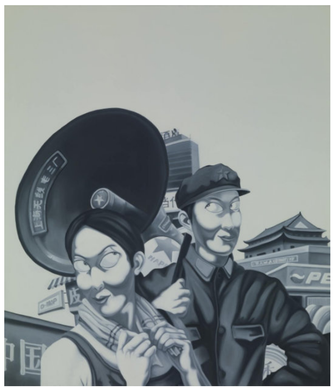
AFTER ZHAO BO. 2009