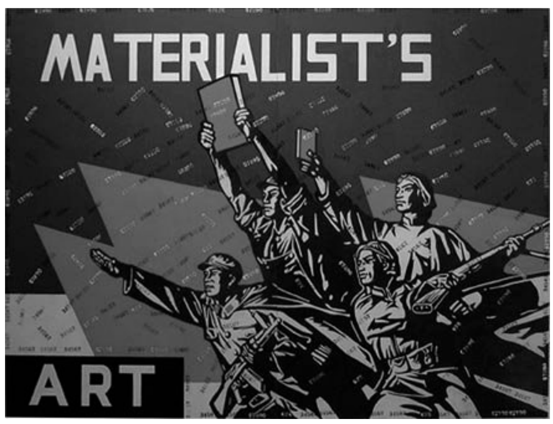
AFTER WANG GUANGYI. 2009