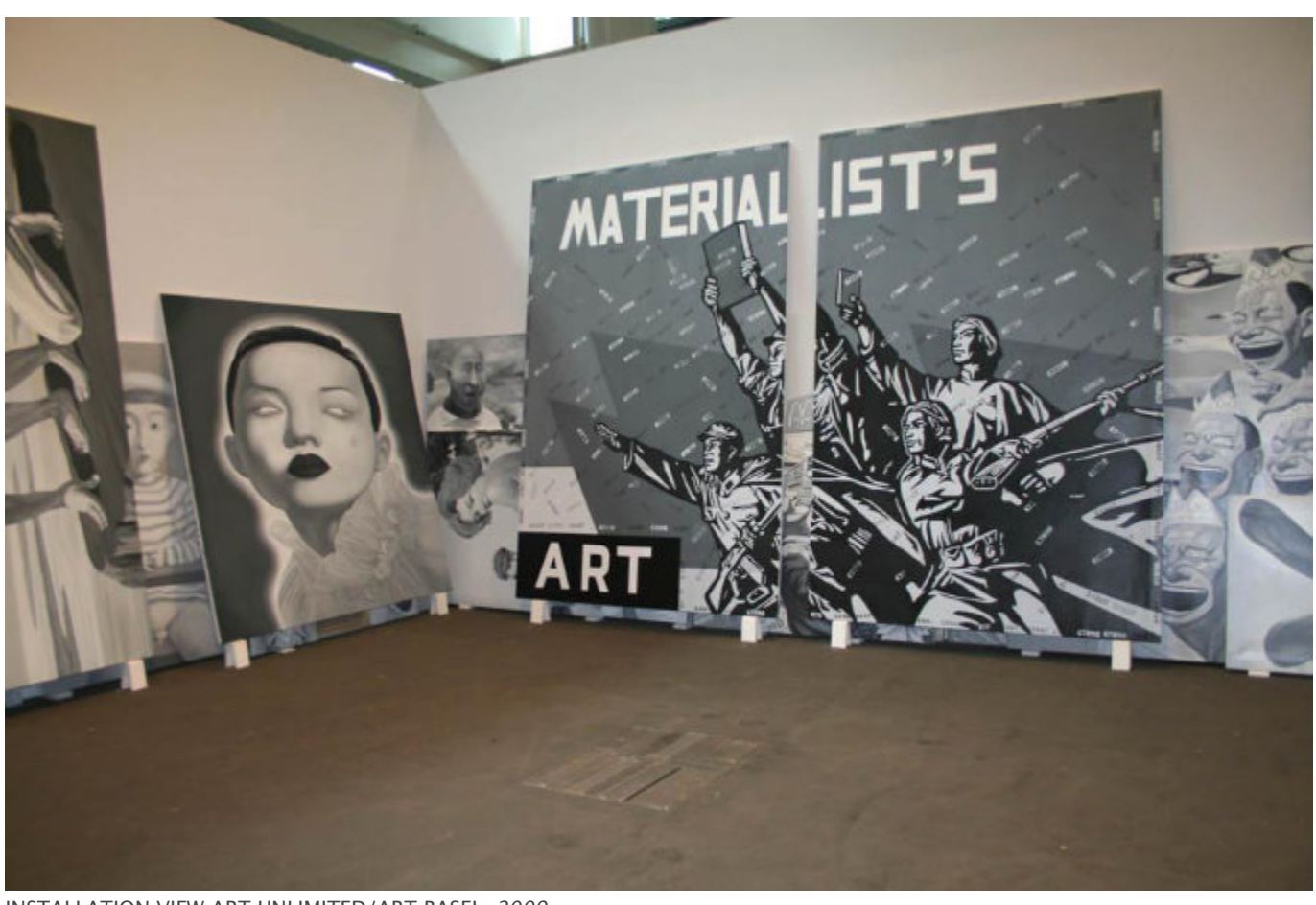
INSTALLATION VIEW ART UNLIMITED/ART BASEL, 2009.