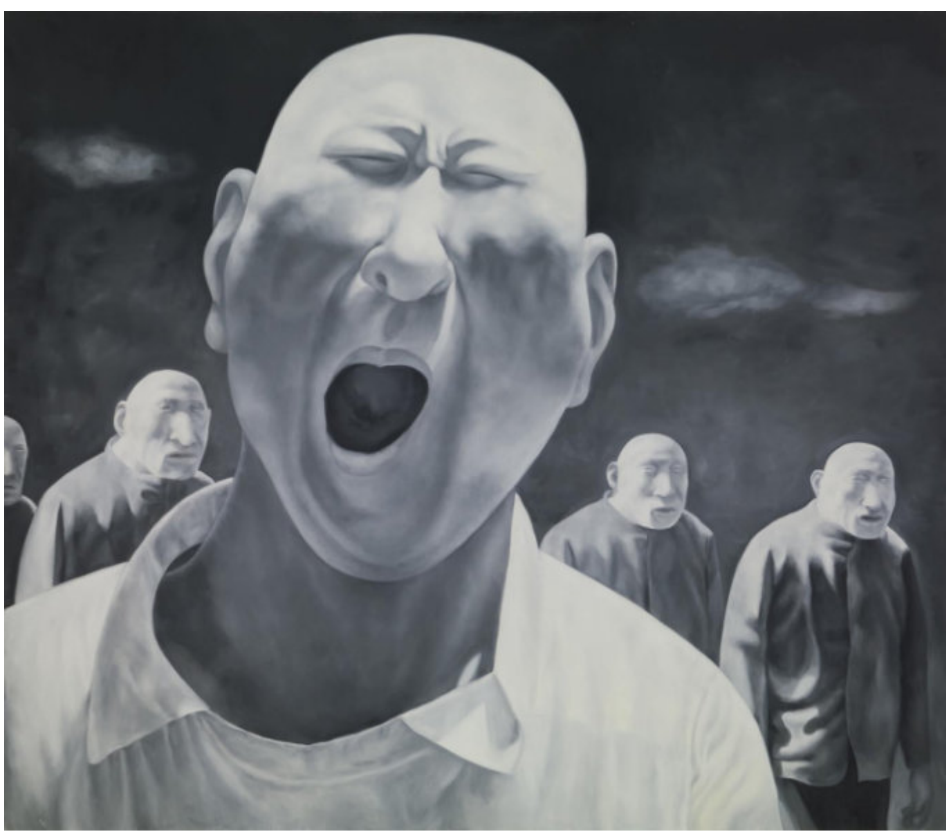
AFTER FANG LIJN. 2009