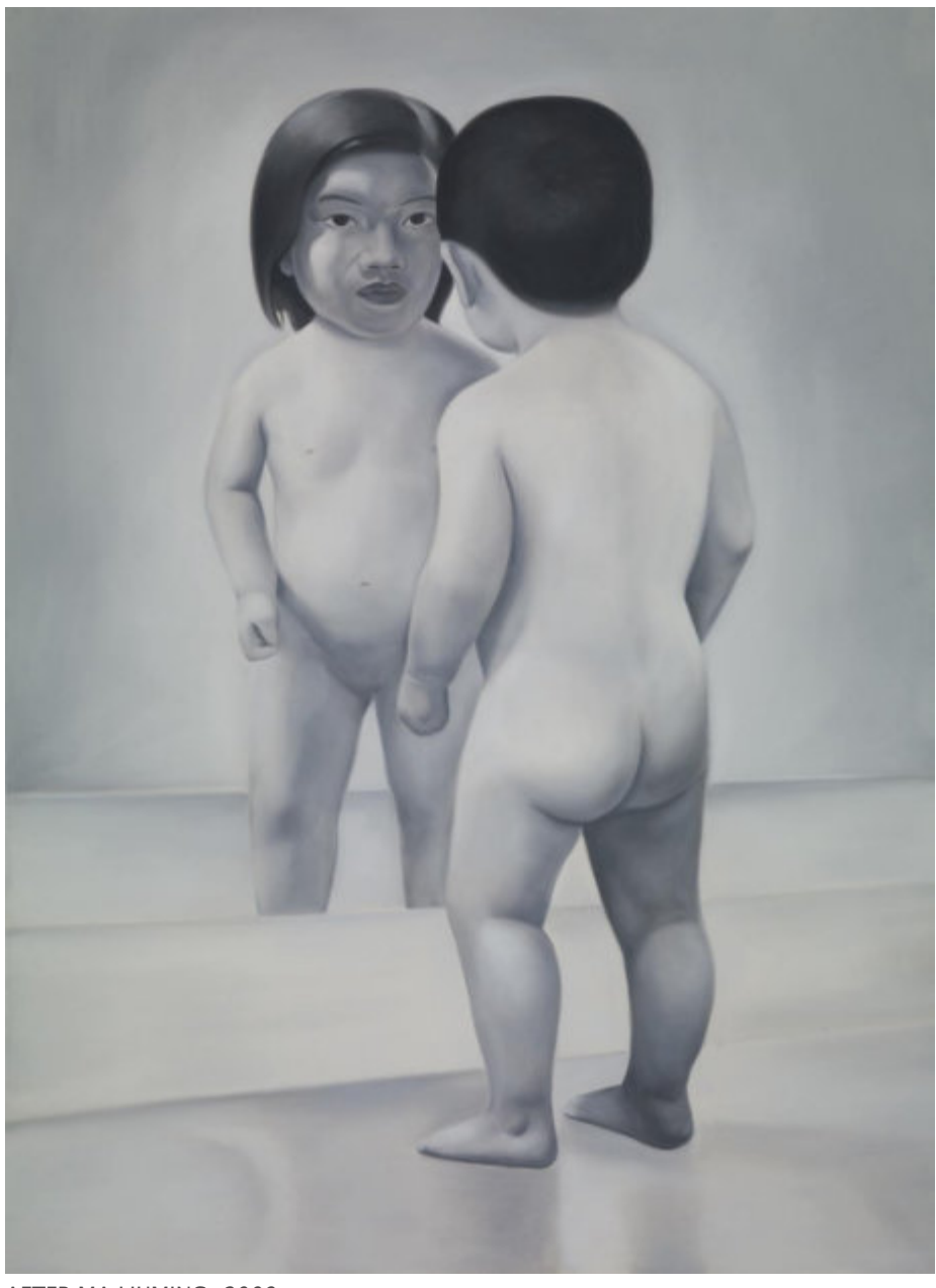
AFTER MA LIUMING. 2009