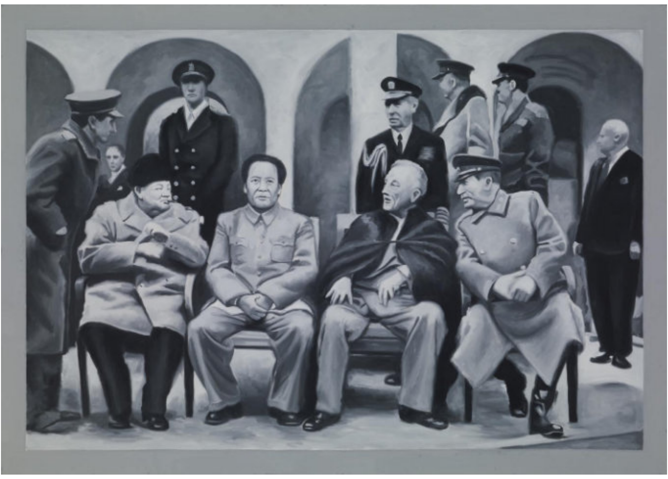
AFTER SHI XINNING. 2009