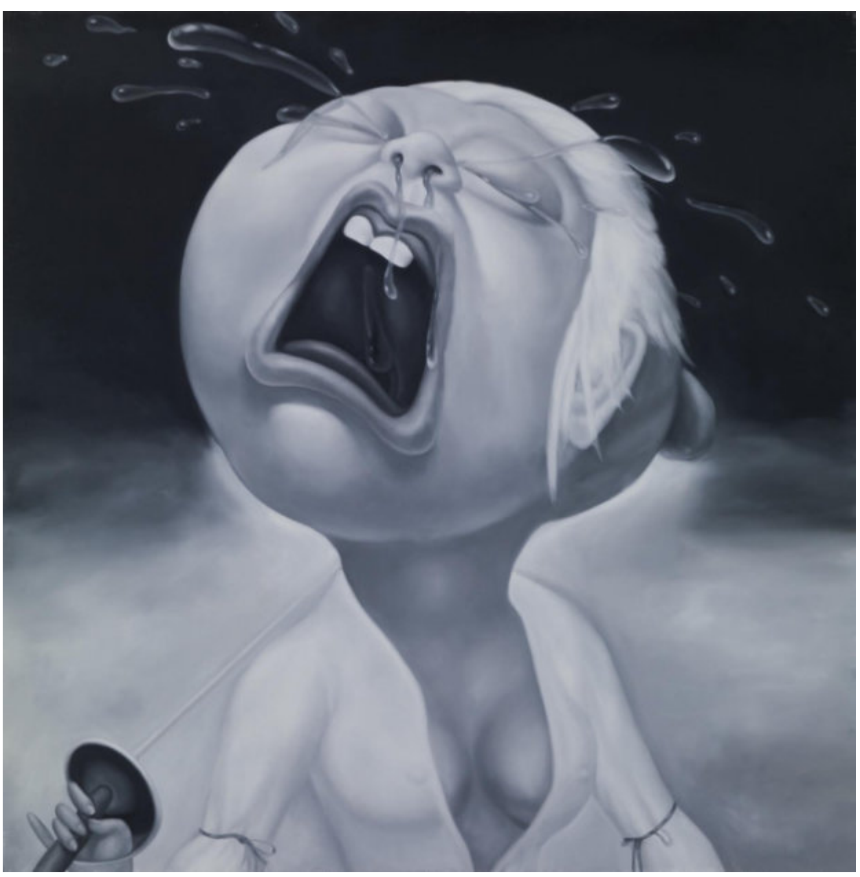
AFTER YIN JUN. 2009