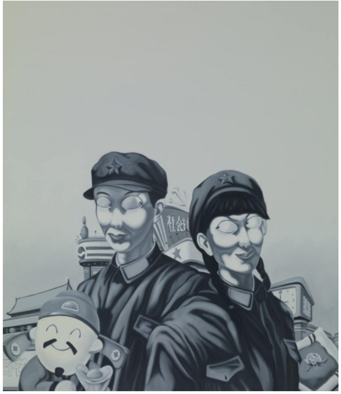
AFTER ZHAO BO. 2009