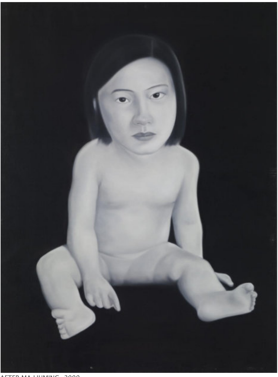
AFTER MA LIUMING. 2009