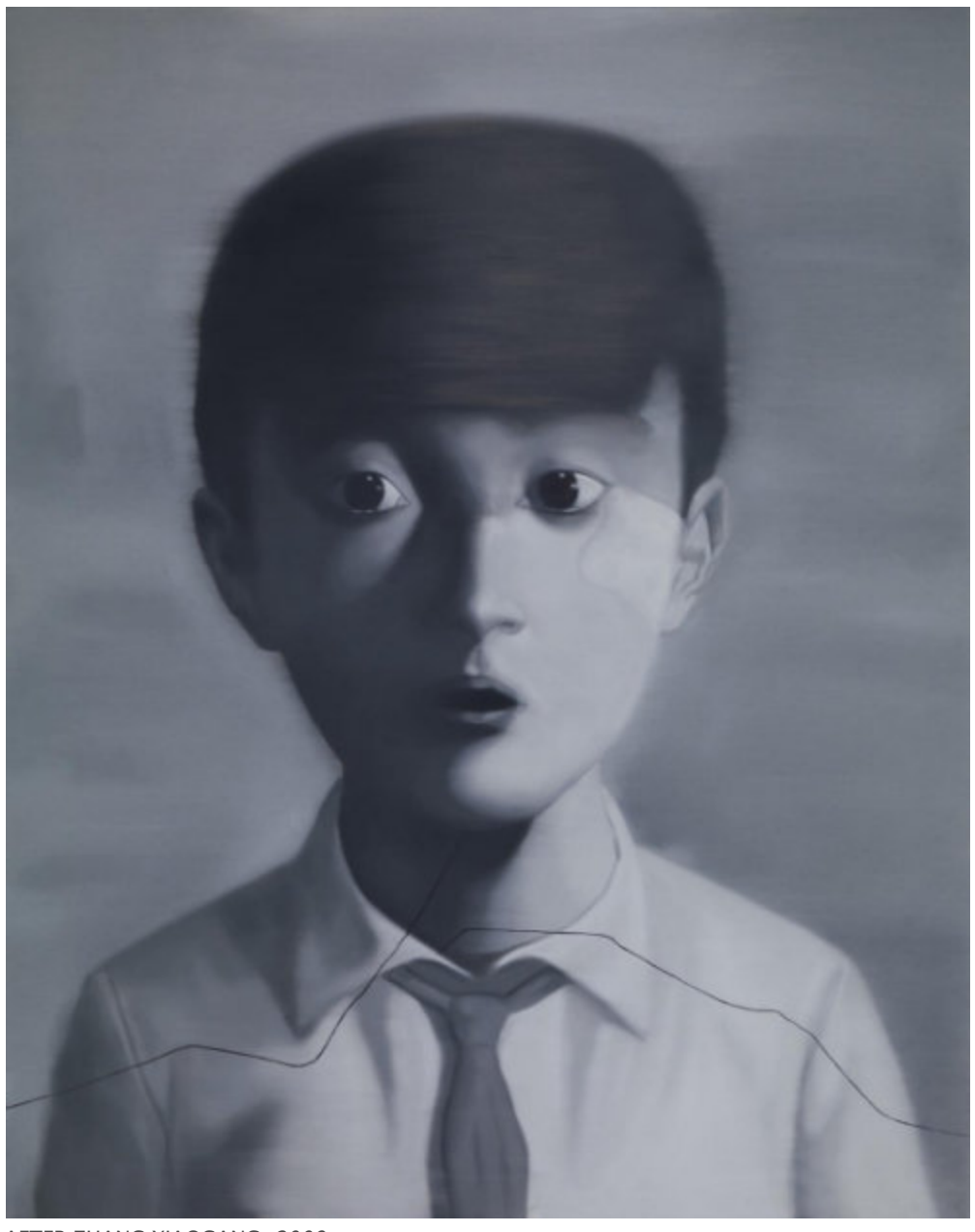
AFTER ZHANG XIAOGANG. 2009