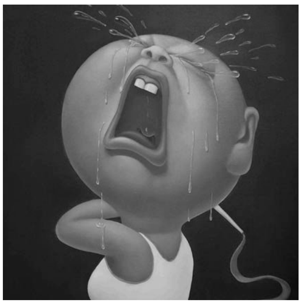
AFTER YIN JUN. 2009