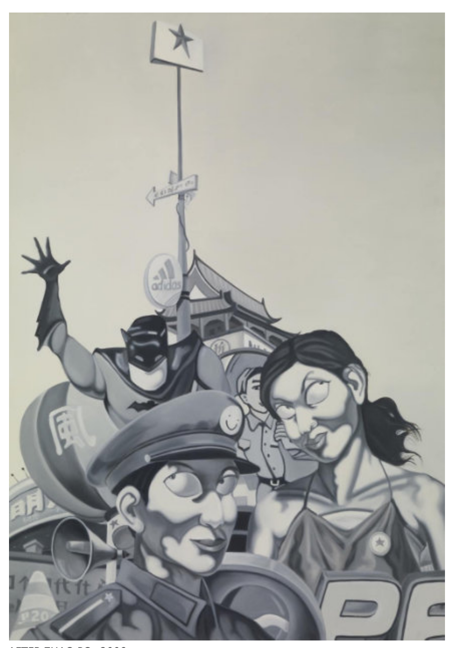
AFTER ZHAO BO. 2009