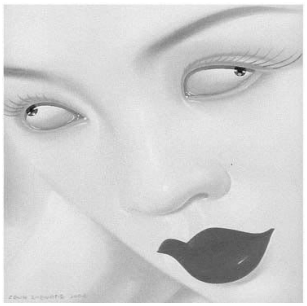
AFTER FENG ZHENGJIE. 2009