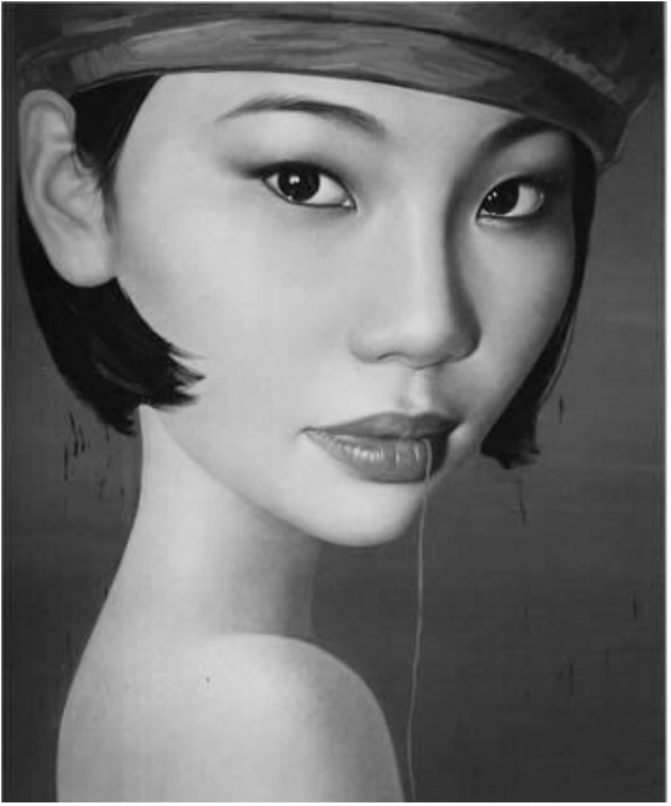
AFTER LING JIAN. 2009