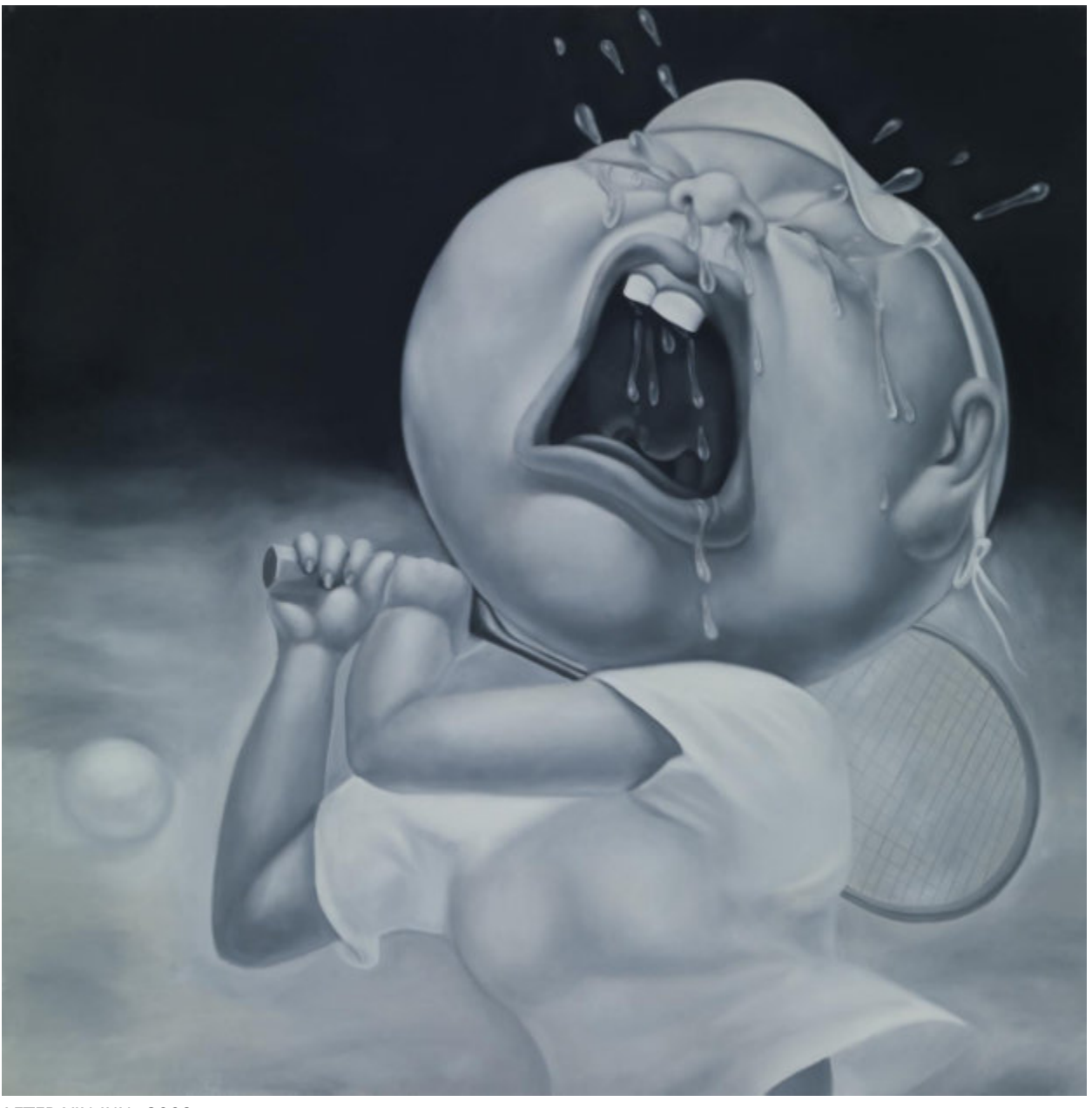
AFTER YIN JUN. 2009