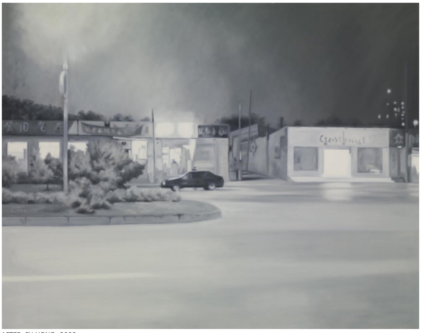
AFTER FU HONG. 2009