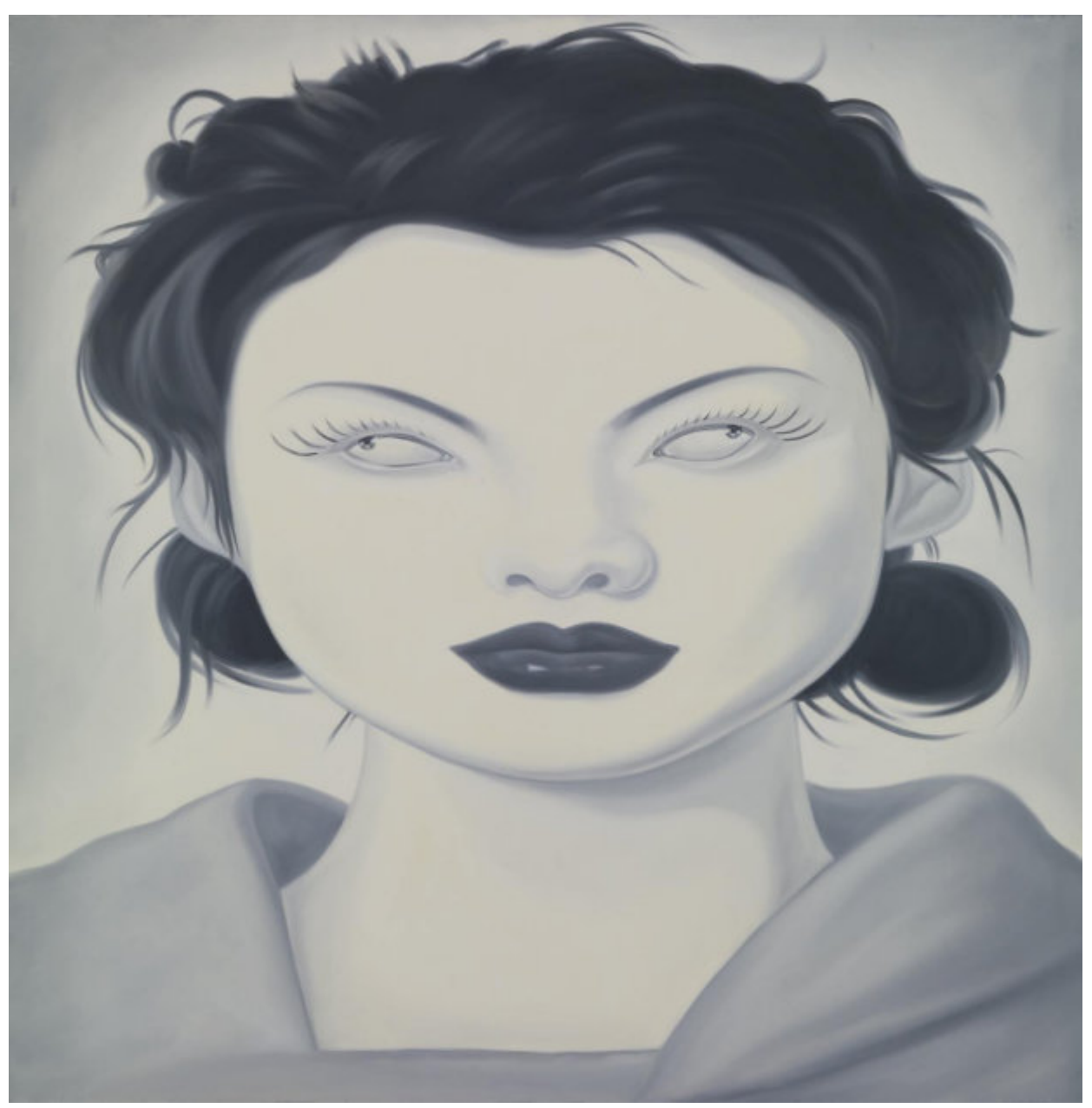
AFTER FENG ZHENGJIE. 2009