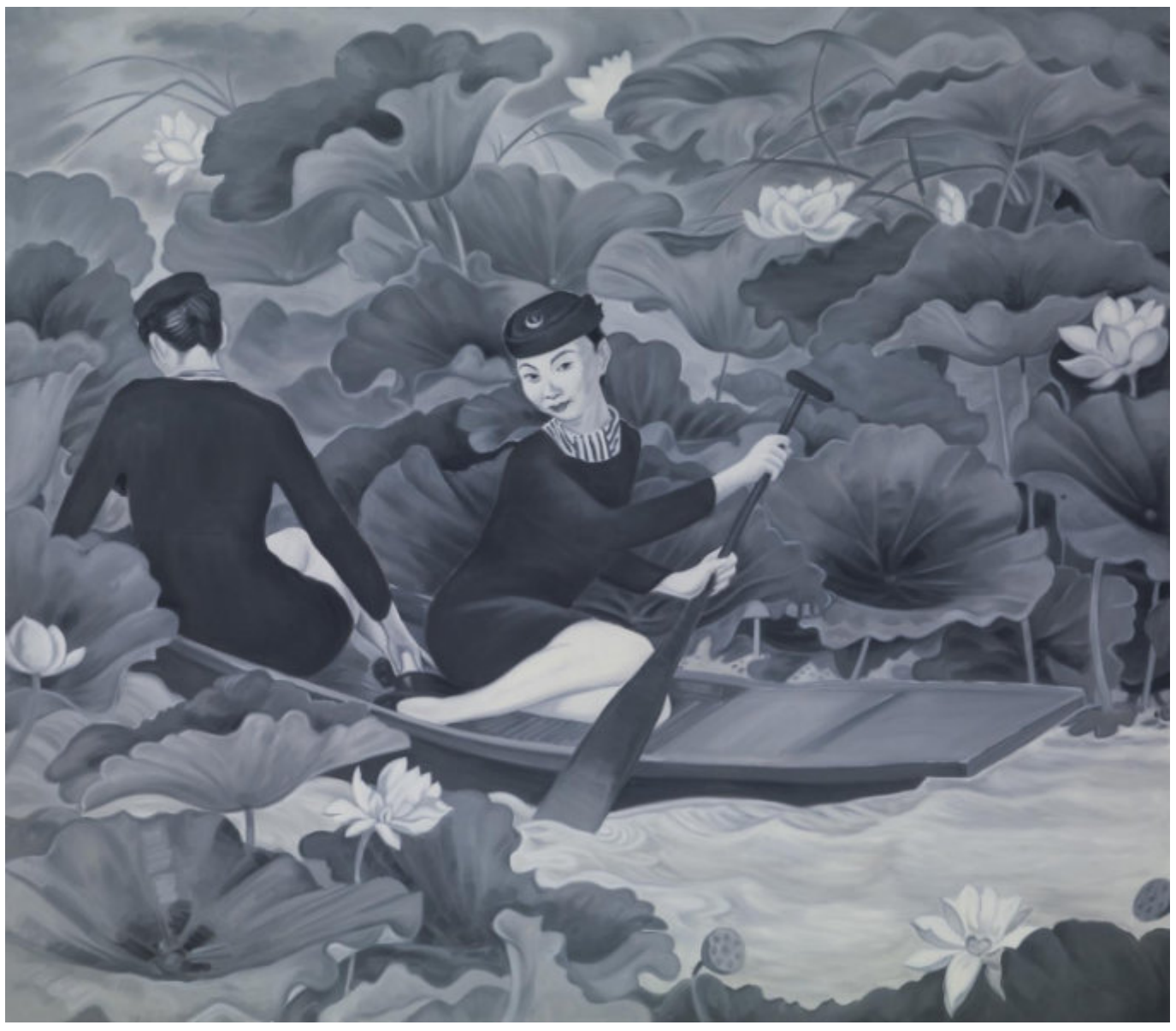
GABRIELE DI MATTEO AFTER WANG XINGWEI. 2009