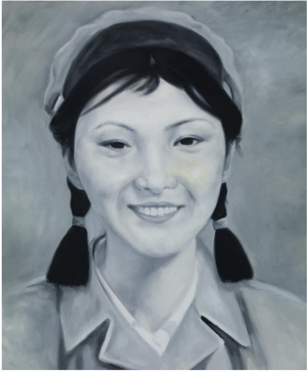
AFTER QI ZHILONG. 2009