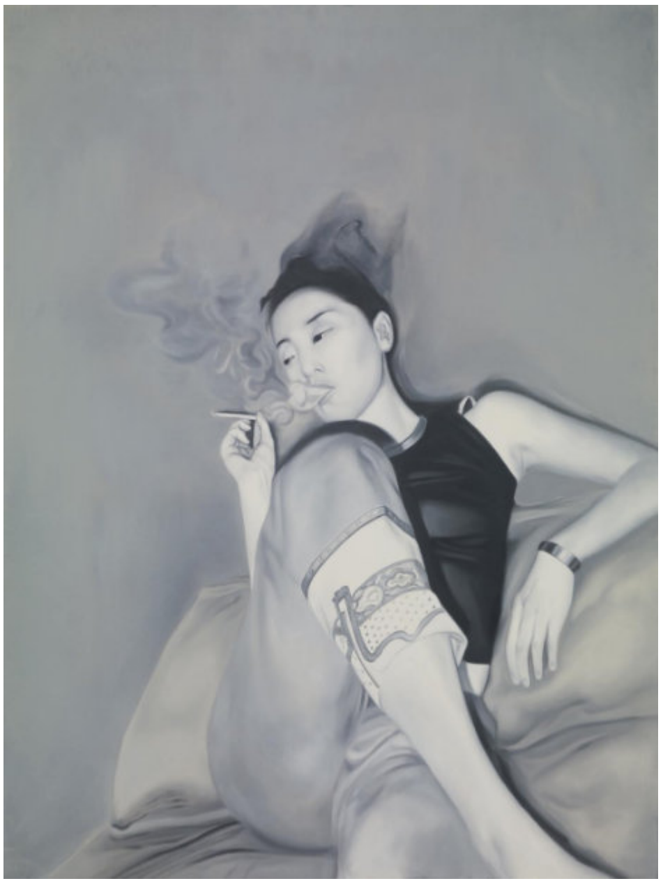
AFTER HE SEN. 2009