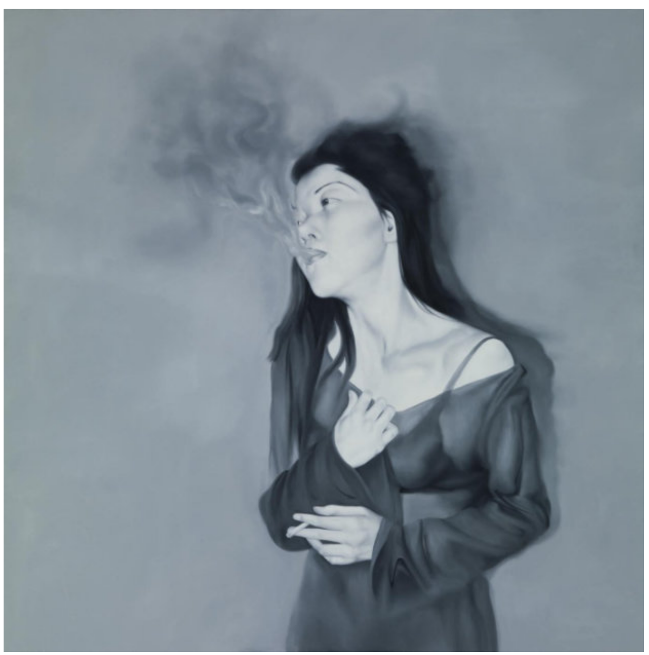
AFTER HE SEN. 2009