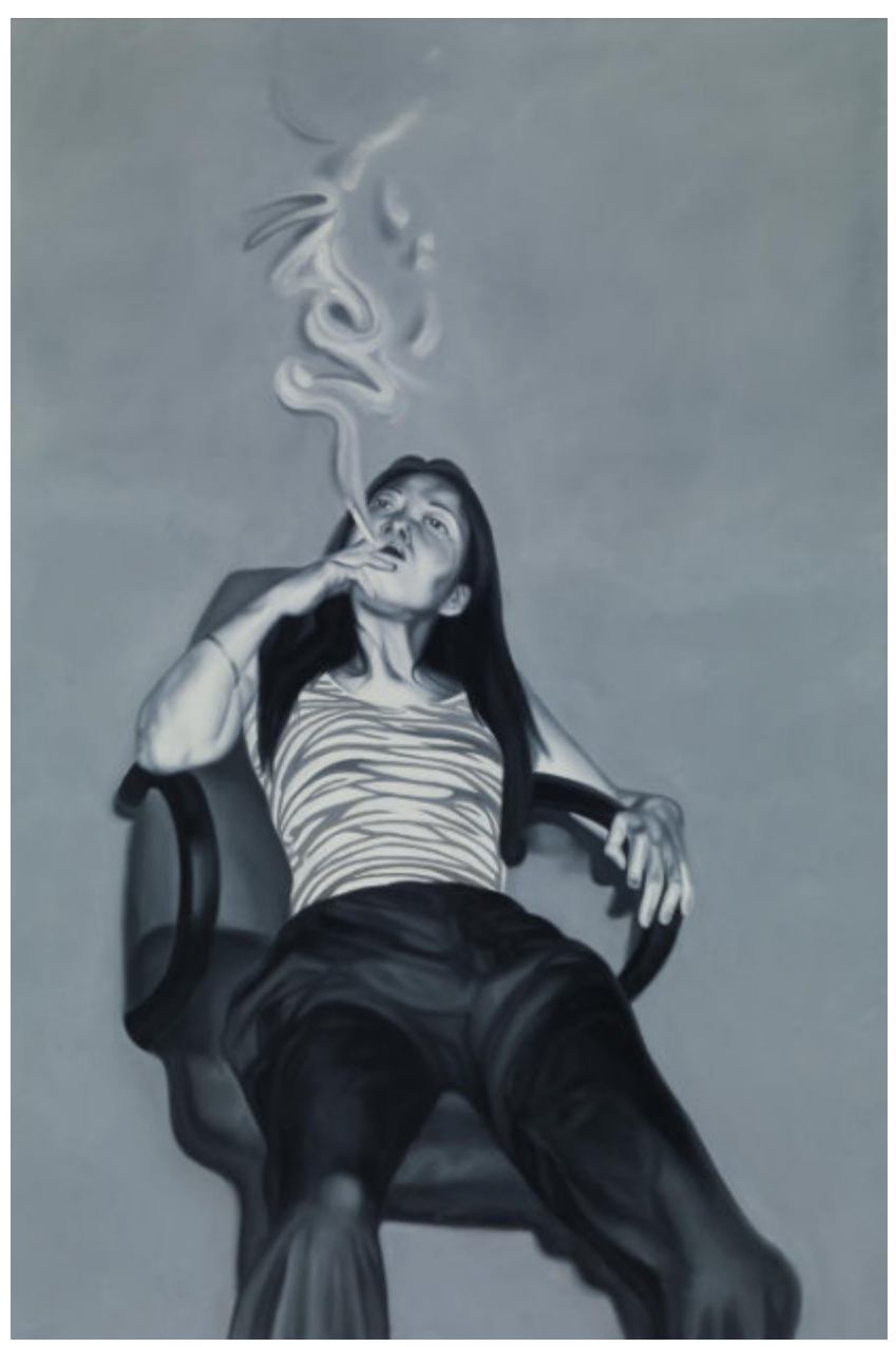
AFTER HE SEN. 2009