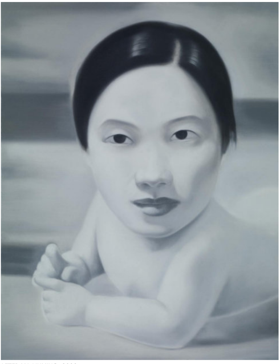
AFTER MA LIUMING. 2009