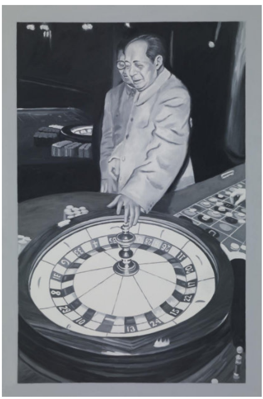
AFTER SHI XINNING. 2009