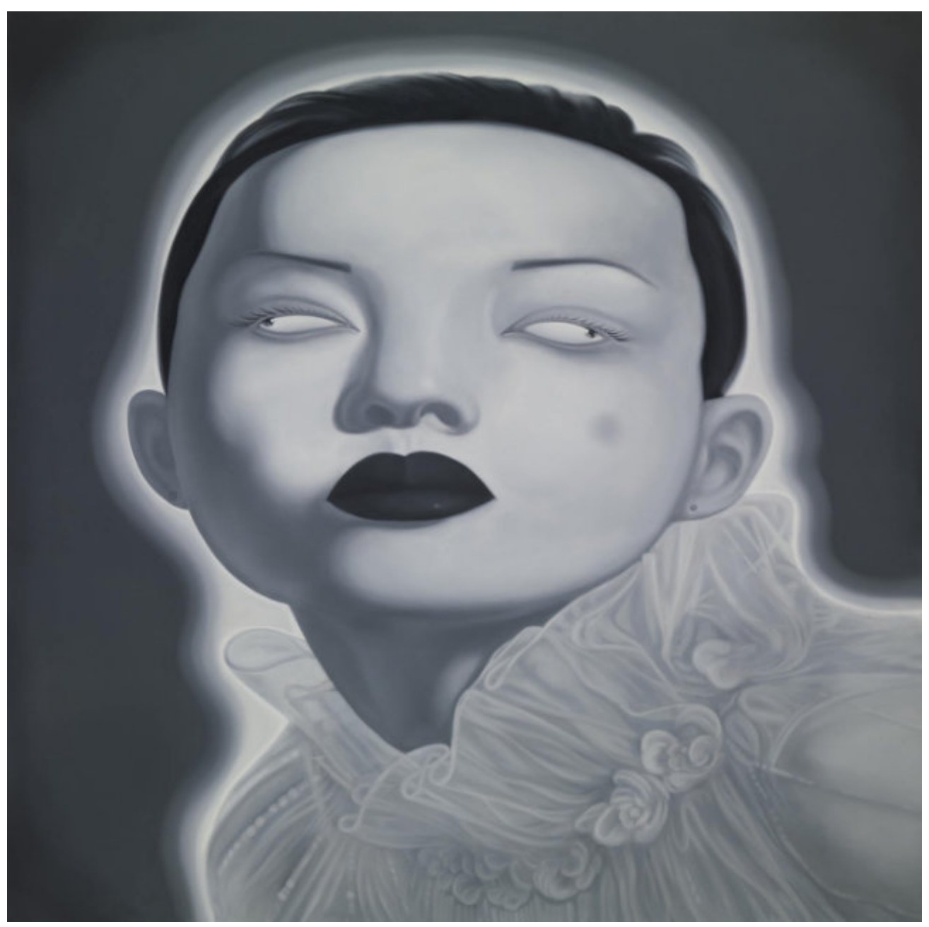
AFTER FENG ZHENGJIE. 2009