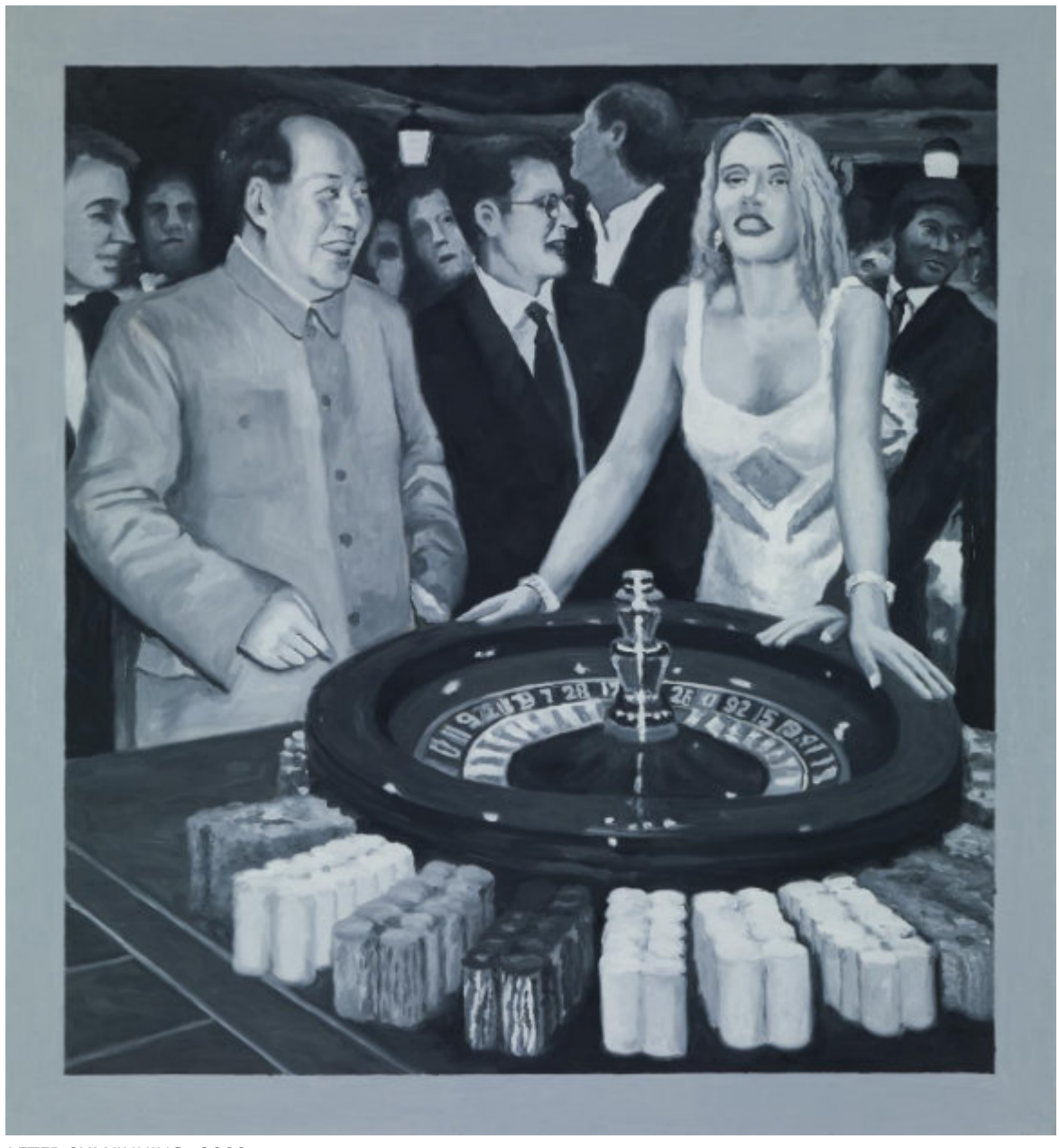
AFTER SHI XINNING. 2009