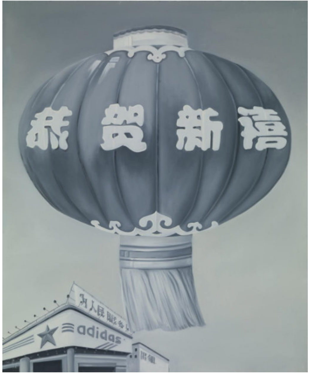
AFTER ZHAO BO. 2009