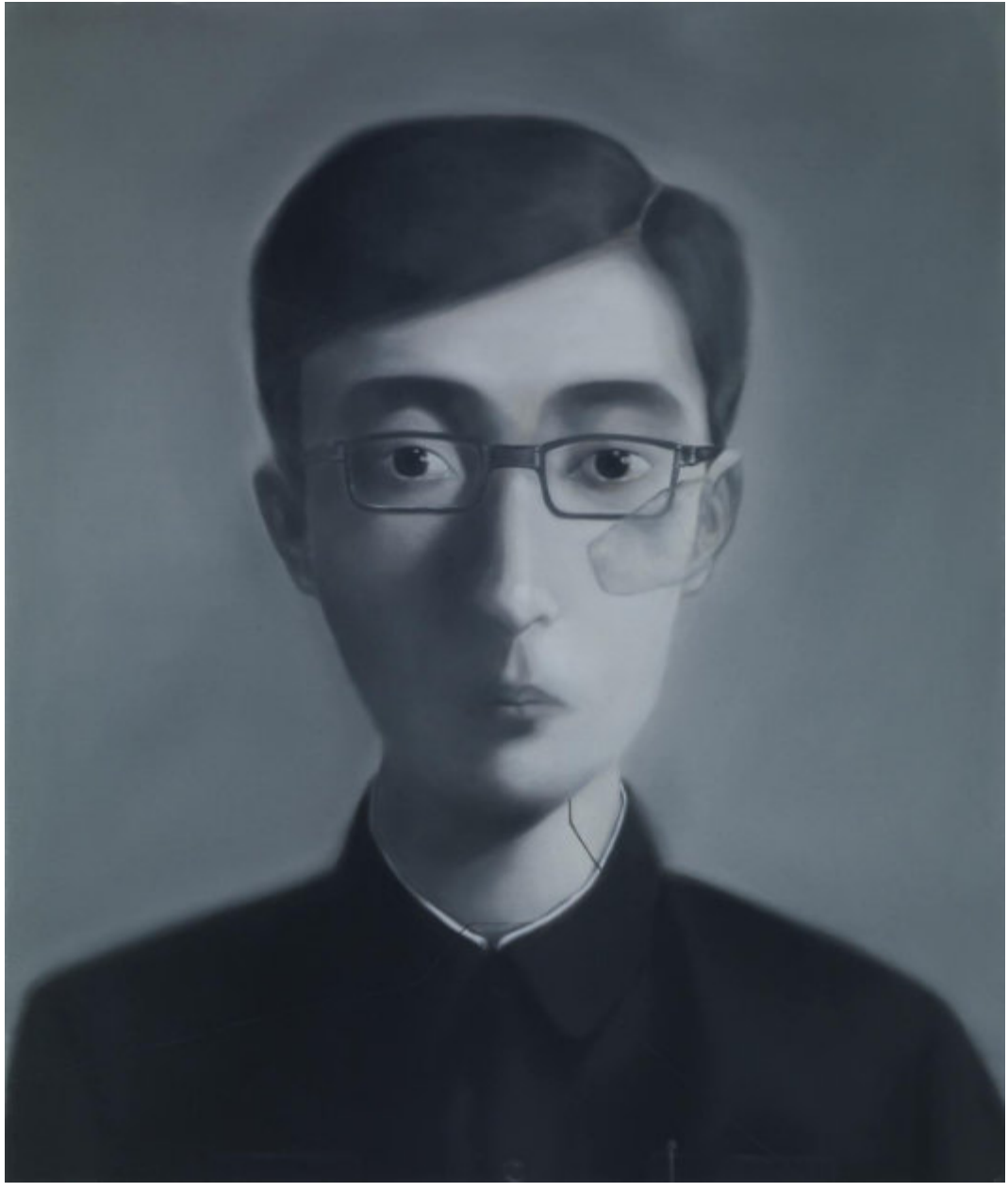
AFTER ZHANG XIAOGANG. 2009