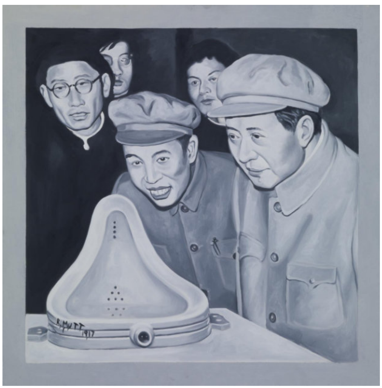
AFTER SHI XINNING. 2009