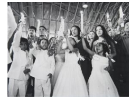
Documenting the Unseen in the Photography of Luis-rey Velasco