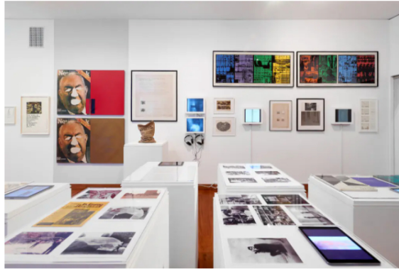
View of "This Must Be the Place: Latin American Artists in New York, 1965-1975" at Americas Society.

Race and class played a role in this, and differing senses of investment in the city. To Latino artists it was both home and battleground. To Latin American transplants it was a stage where a politics of aesthetics was playing out in new avant-garde styles and forms: Minimalism, Conceptualism, video and performance. And what extraordinary artists the experiments brought to New York: temporarily, Hélio Oiticica from Brazil, Marta Minujín from Argentina, Zilia Sánchez Domínguez from Cuba; permanently, Luis Camnitzer from Uruguay, Juan Downey from Chile, Freddy Rodríguez from the Dominican Republic.