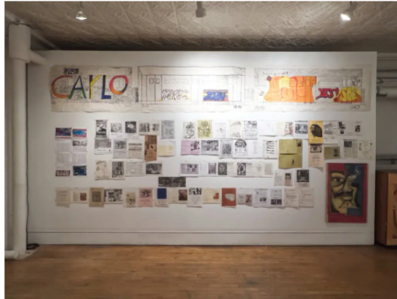
Installation view of "Temporal Chronology" at Taller Boricua.