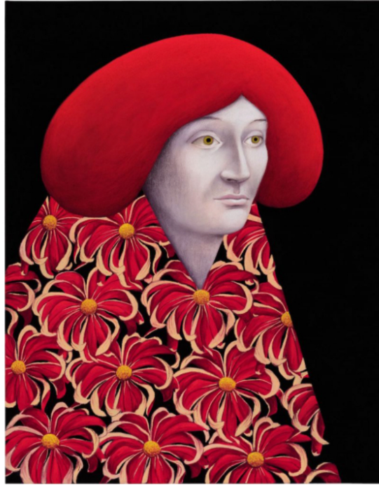
Nicolas Party Portrait with Red Flowers (2020).