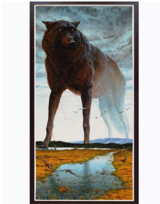
Walton Ford, MORGUNDÖGG , (2020) at Galerie Max Hetzler.

"In excess of" $1 million: Walton Ford, MORGUNDÖGG , (2020) at Galerie Max Hetzler