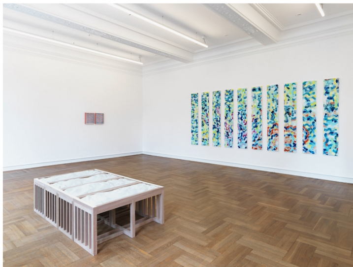
Installation view of Theoretical Beach

Last month saw the opening of Theoretical Beach , a solo show by Diango Hernández running at the Museum Morsbroich in Leverkusen, Germany through August 28.