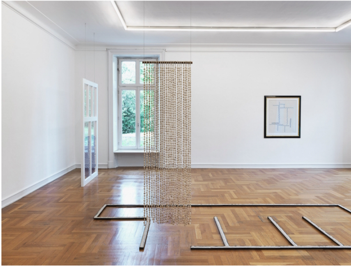
Installation view of Theoretical Beach

Theoretical Beach is presented on two floors of the museum, which is housed in a Baroque castle. The ground floor galleries are devoted to works that Hernández called "an articulation of rediscovered memories."