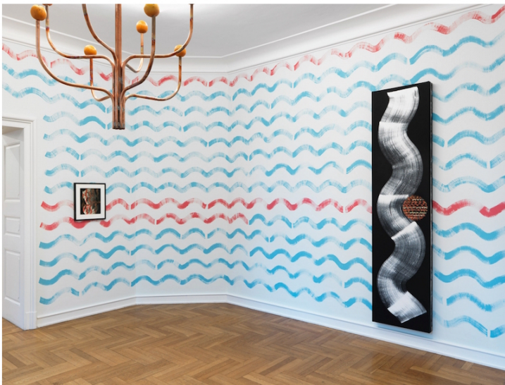
Installation view of Theoretical Beach

The floor plan of his apartment in Cuba is incorporated into one sculptural installation.