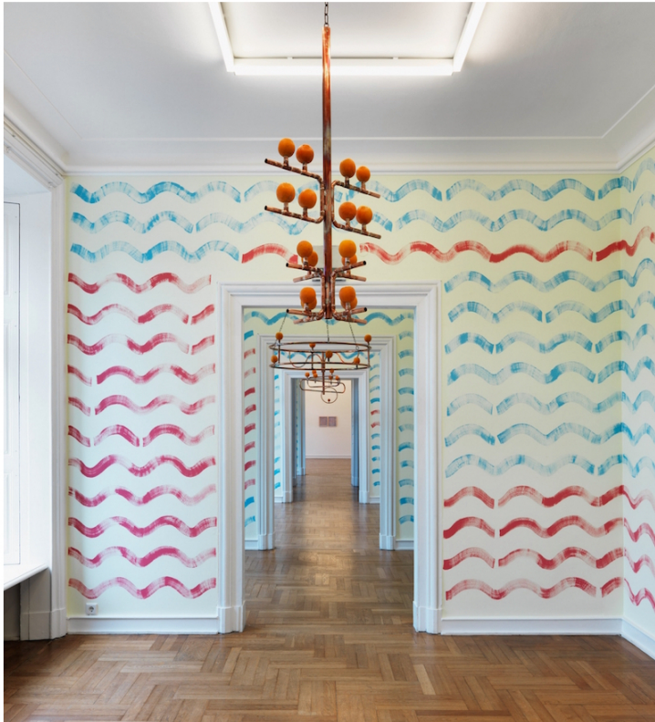
Installation view of Theoretical Beach

All the characters of the font resemble a diagrammatic wave. Once the text is translated into this font, it looks like a schematic ocean painted on the walls of the gallery.