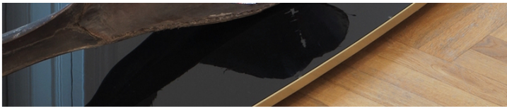
A work by Diango Hernández in Theoretical Beach Courtesy diangofernandez.com

Theoretical Beach is presented on two floors of the museum, which is housed in a Baroque castle. The ground floor galleries are devoted to works that Hernández called "an articulation of rediscovered memories."