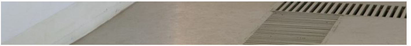
Zhou Wendou, Intertwined, 2007, Installation at Overdose.