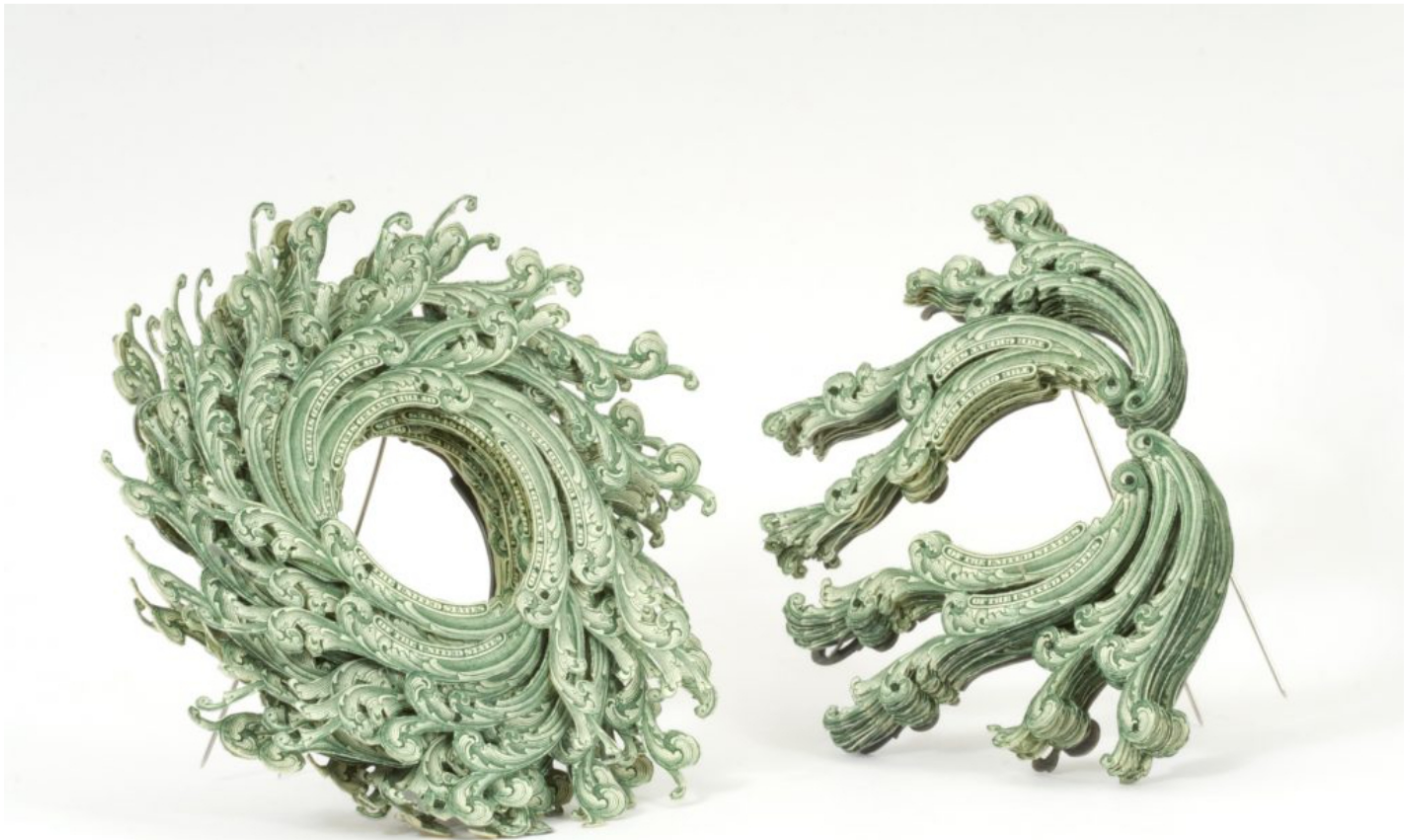
Lauren Tickle, $54.00 Currency Converted (with latex), 2012, Brooches, Photo by Jacqueline Von Emde