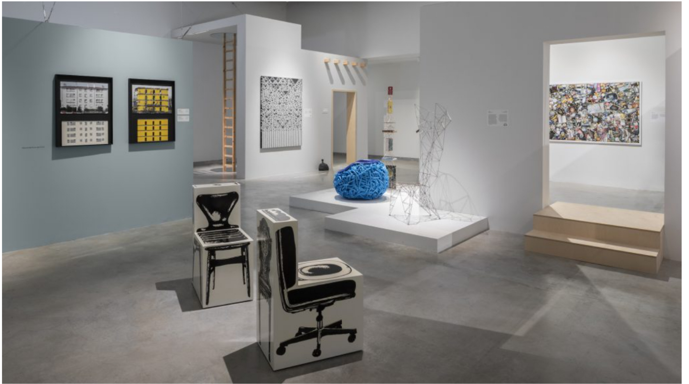
Installation of Overdose, Design Museum Holon