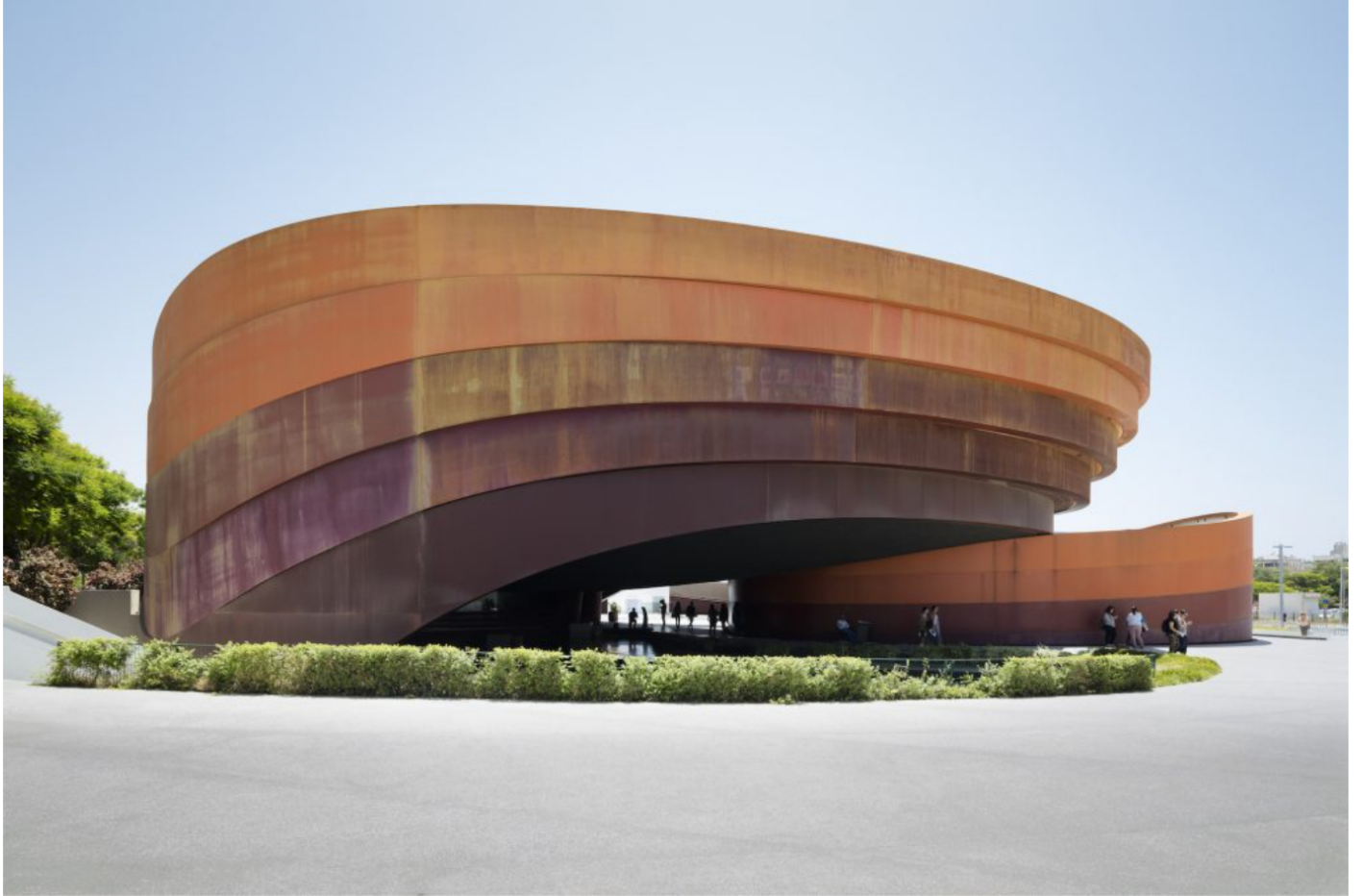
Design Museum Holon.